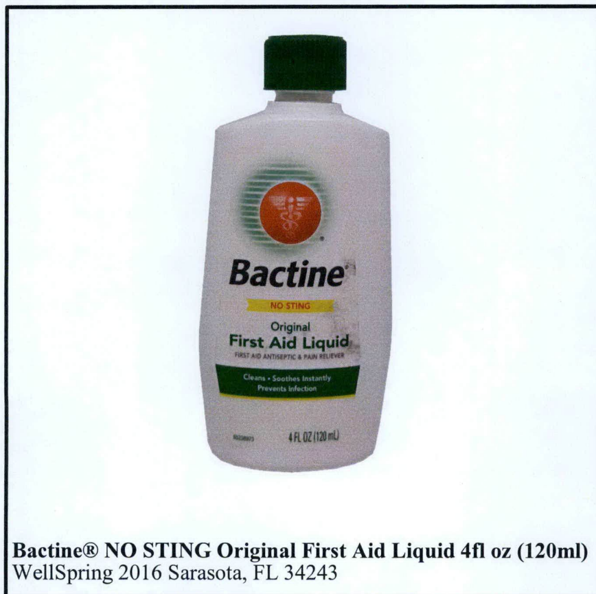
Bactine® NO STING Original First Aid Liquid 4fl oz (120ml) WellSpring 2016 Sarasota, FL 34243

The Food and Drug Administration (FDA) advises the public against the purchase and use of the following unregistered drug products: