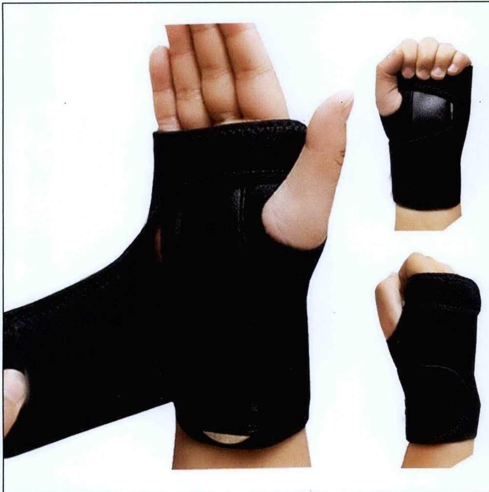
Figure 1. Unregistered 1Pair Left+Right Bandage Orthopedic Hand Brace Wrist Support Finger Splint Carpal Tunnel Syndrom

The Food and Drug Administration (FDA) warns all healthcare professionals and the general public against the purchase and use of the unregistered medical device: