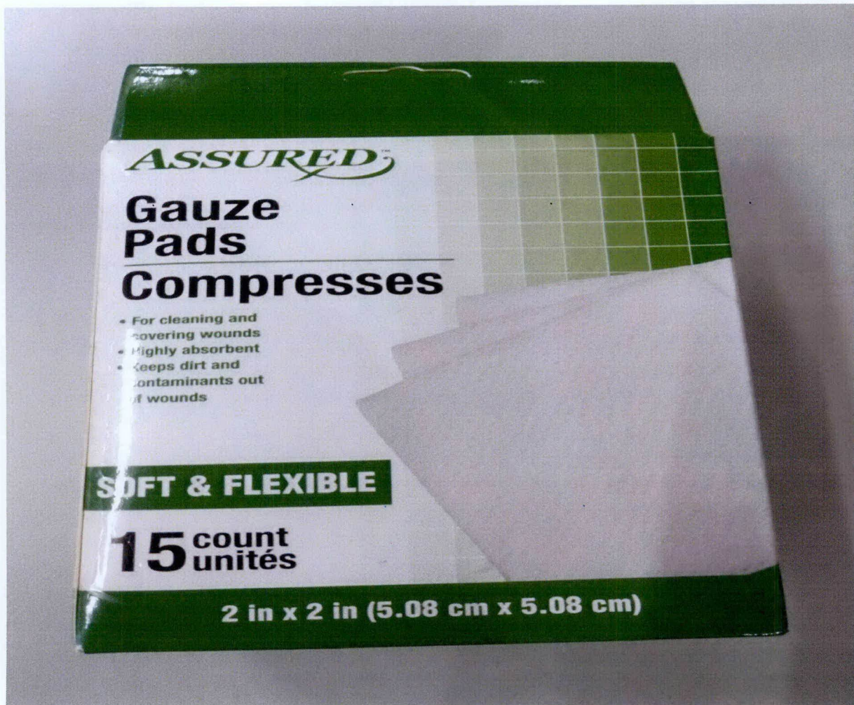
Figure 1. Unregistered Assured Gauze Pads Compresses

The Food and Drug Administration (FDA) warns all concerned healthcare professionals and the public against the purchase and use of the unregistered medical device: