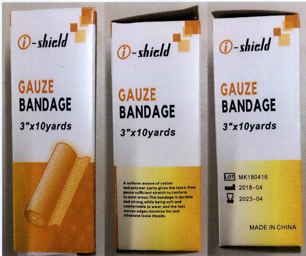
Figure 1. Unregistered i-shield Gauze Bandage 3” x 10 yards

The Food and Drug Administration (FDA) warns all healthcare professionals and the general public against the purchase and use of the unregistered medical device: