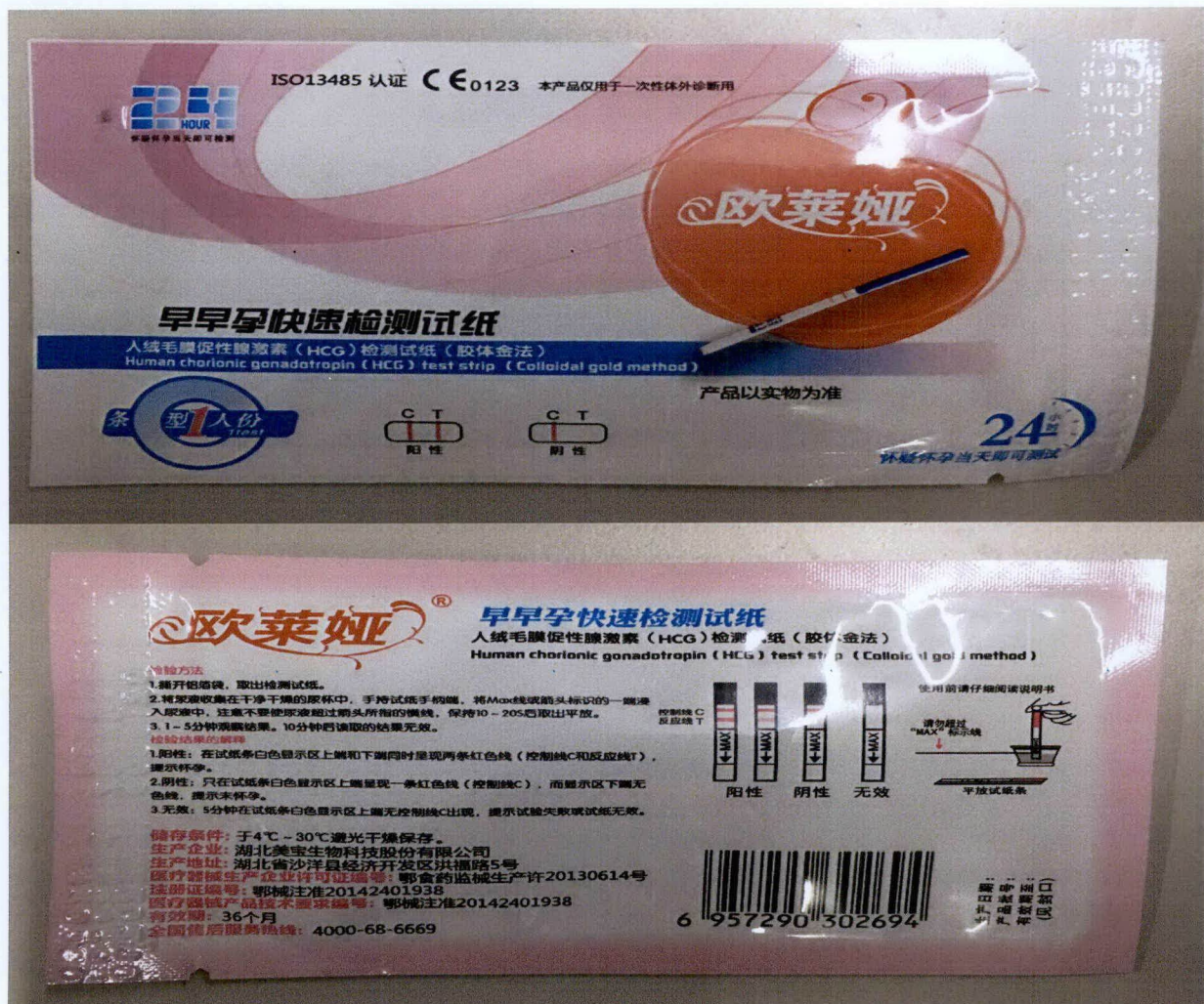
Figure 1. Unregistered HCG Test Strip

The Food and Drug Administration (FDA) warns all healthcare professionals and the general public against the purchase and use of the unregistered medical device: