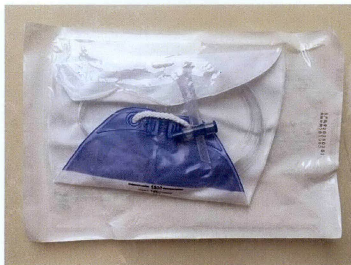
Figure 1. Unregistered Steadlive® Anti Regurgitation Drainage Bag-Medical Urine Collection Bag