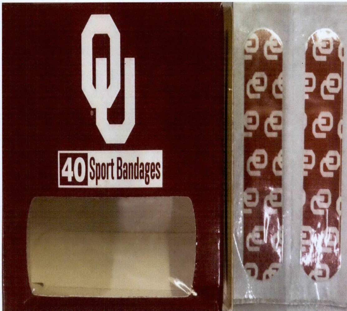
Figure 1. Unregistered OU 40 Sport Bandages

The Food and Drug Administration (FDA) warns all healthcare professionals and the general public against the purchase and use of the unregistered medical device: