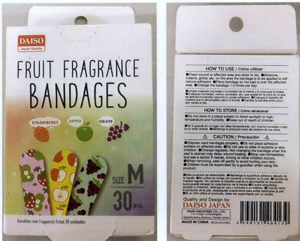
Figure 1. Unregistered Daiso – Fruit Fragrance Bandages

The Food and Drug Administration (FDA) warns the general public and all healthcare professionals against the purchase and use of the unregistered medical devices: