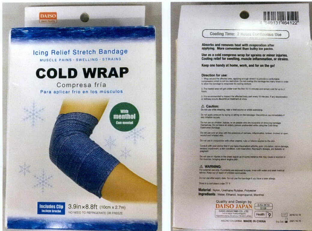
Figure 2. Unregistered Daiso – Cold Wrap – Icing Relief Stretch Bandage

The FDA verified through post-marketing surveillance that the abovementioned medical devices are not registered and the Certificates of Product Registration (CPR) have not yet been issued. Pursuant to the Republic Act No. 9711, otherwise known as the “Food and Drug Administration Act of 2009”, the manufacture, importation, exportation, sale, offering for sale, distribution, transfer, non-consumer use, promotion, advertising or sponsorship of health products without the proper authorization is prohibited.