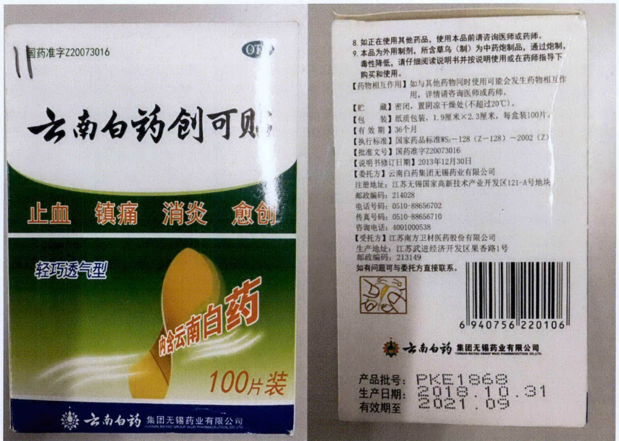
Figure 3. Unregistered Adhesive Bandage