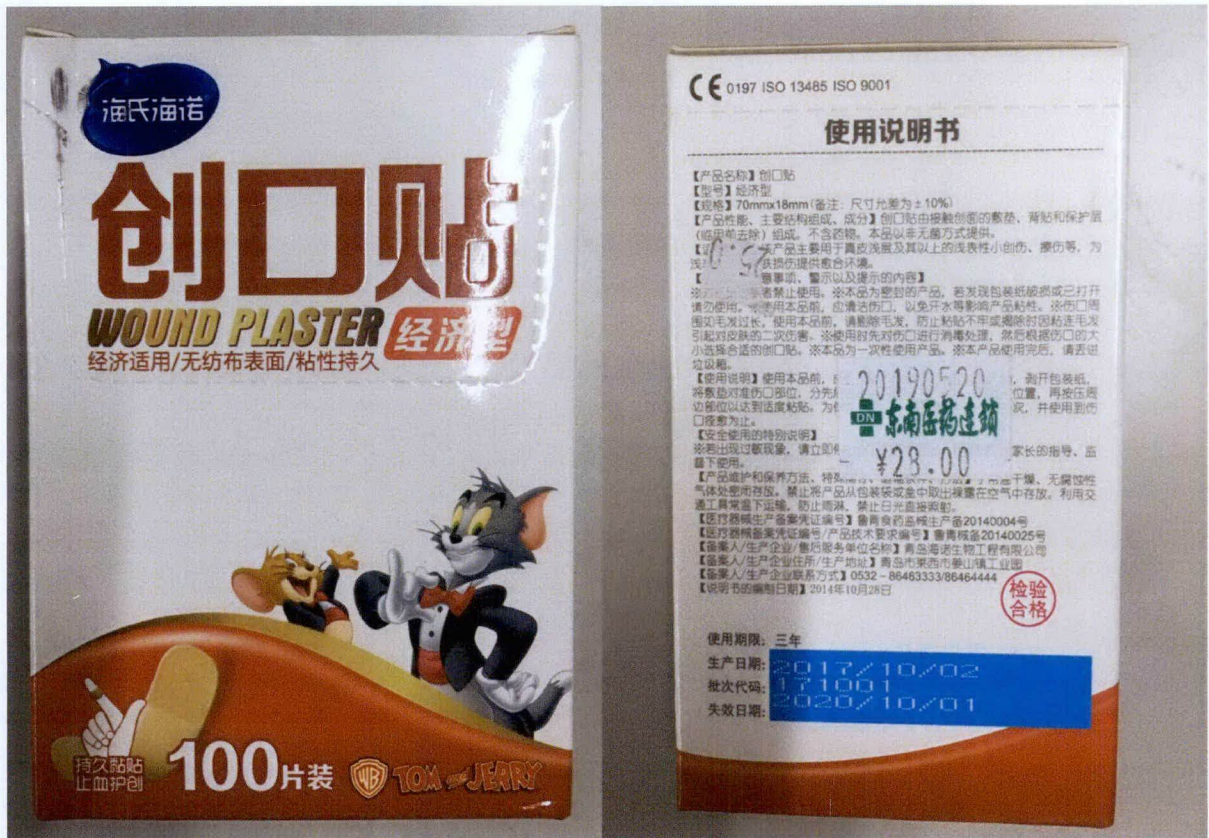
Figure 2. Unregistered Adhesive Bandage