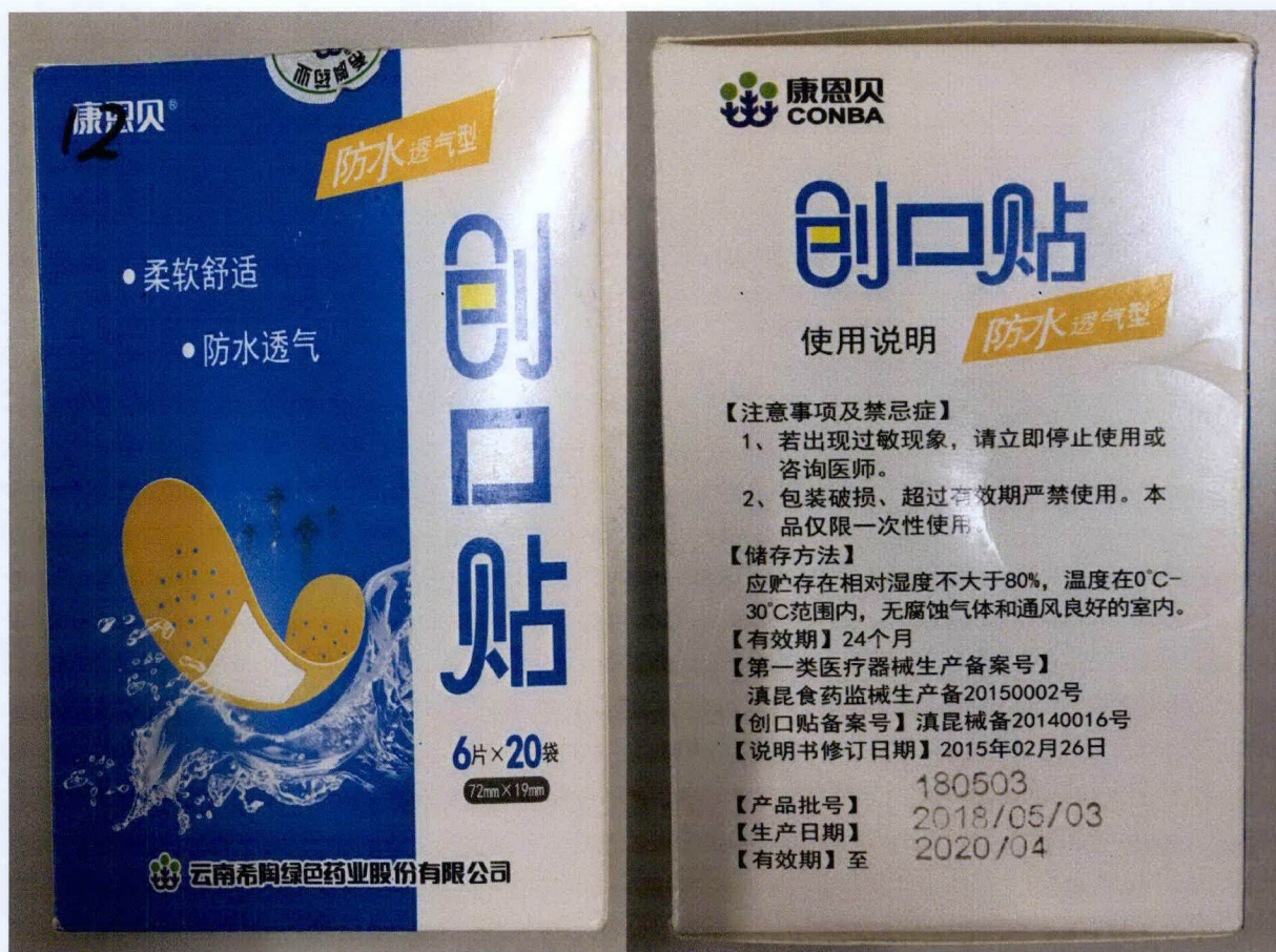
Figure 1. Unregistered Adhesive Bandage

The Food and Drug Administration (FDA) warns the general public and all healthcare professionals against the purchase and use of the unregistered medical devices: