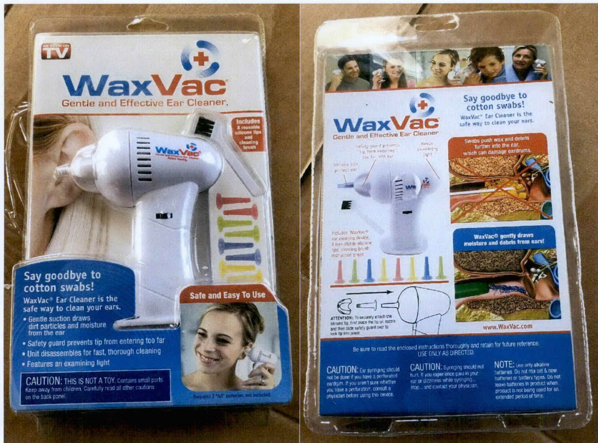
Figure 1. Unregistered Waxvac™ Ear Cleaner

The Food and Drug Administration (FDA) warns all healthcare professionals and the general public against the purchase and use of the unregistered medical device: