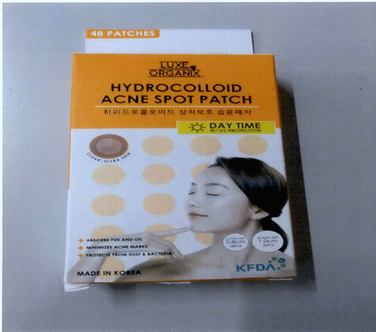
Figure 1. Unregistered Luxe Organix Hydrocolloid Acne Spot Patch Day Time

The Food and Drug Administration (FDA) warns all concerned healthcare professionals and the public against the purchase and use of the unregistered medical device: