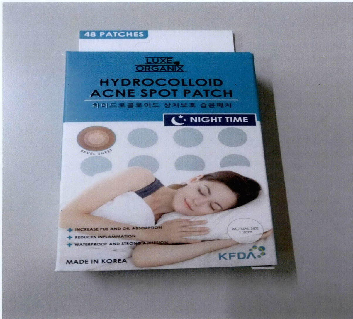
Figure 1. Unregistered Luxe Organix Hydrocolloid Acne Spot Patch Night Time

The Food and Drug Administration (FDA) warns all concerned healthcare professionals and the public against the purchase and use of the unregistered medical device: