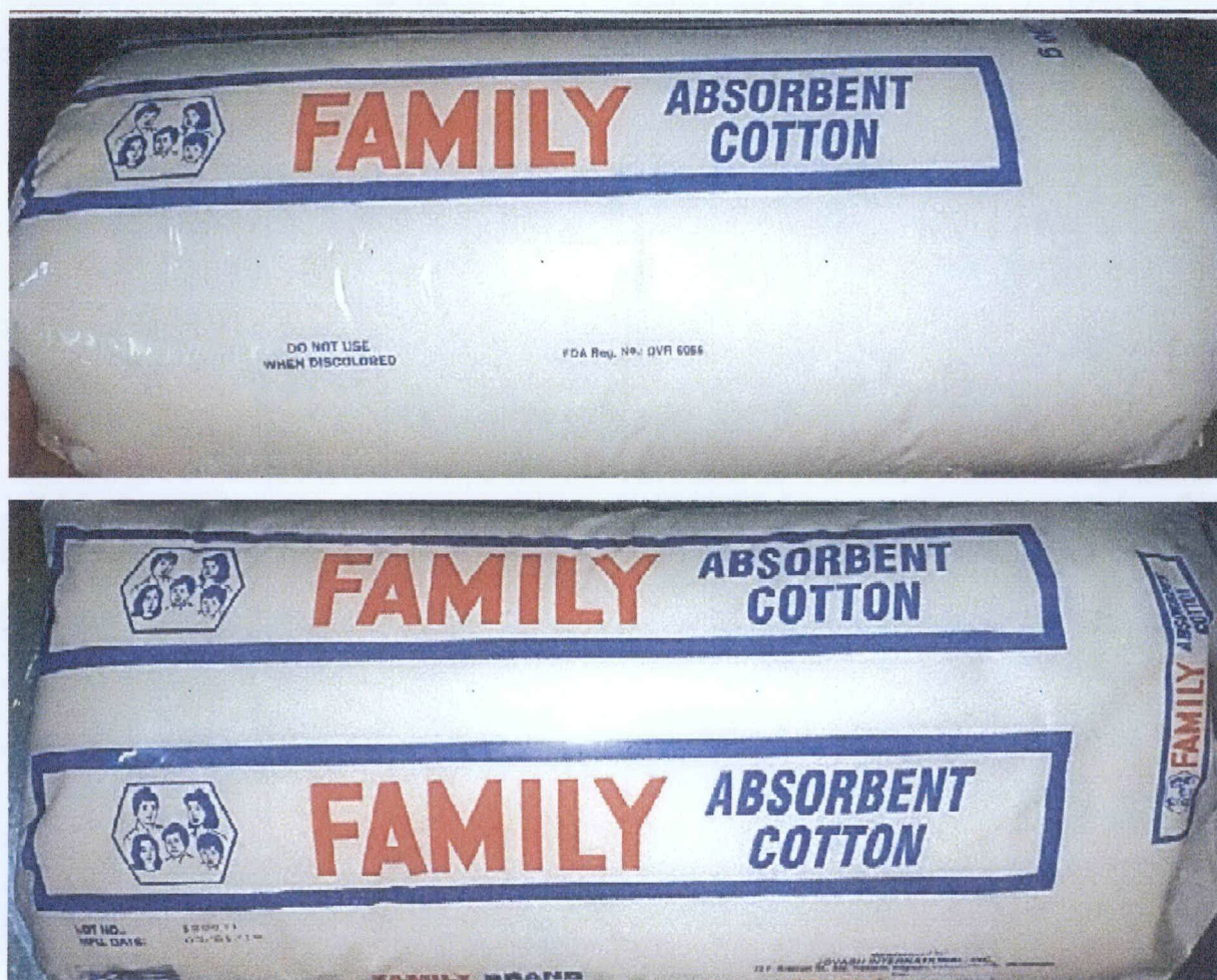
Figure 1. Unregistered Family Brand Absorbent Cotton

The Food and Drug Administration (FDA) warns all healthcare professionals and the general public against the purchase and use of the unregistered medical device: