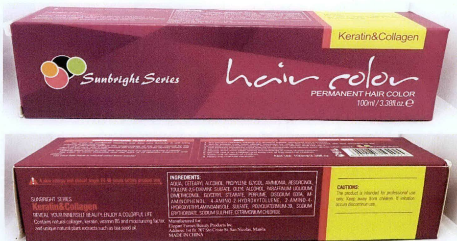
Figure 1. Unnotified Sunbright Series Keratin & Collagen Hair Color 9.91 (Silver Ash)

The Food and Drug Administration (FDA) warns the public from purchasing and using the following unnotified cosmetic products: