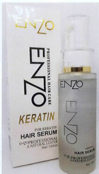
Figure 4. Unnotified Enzo Professional Hair Care Hair Serum Keratin