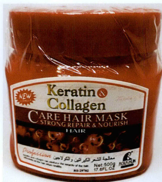
Figure 5. Unnotified Roushun Keratin & Collagen Care Hair Mask Strong Repair & Nourish Hair