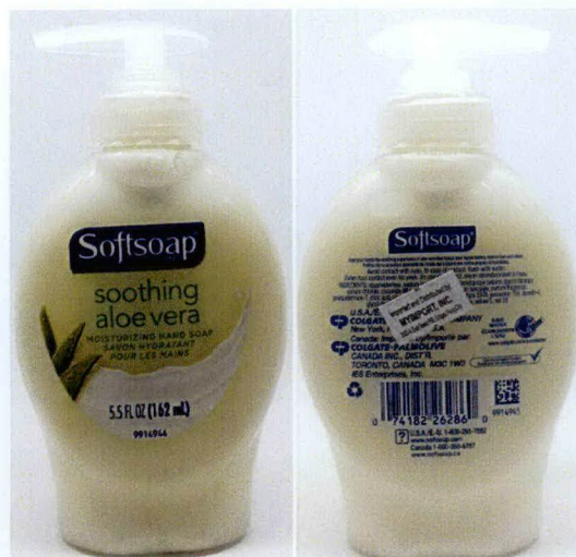
Figure 3 Unnotified Softsoap® Soothing Aloe Vera Moisturizing Hand Soap