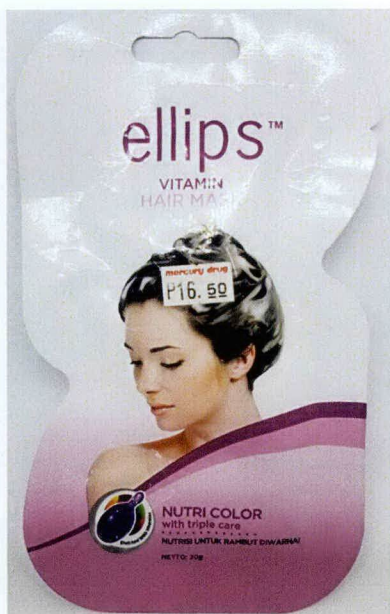
Figure 2. Unnotified Ellips™ Vitamin Hair Mask Nutri Color with Triple Care