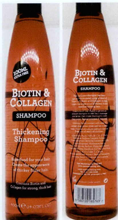
Figure 4. Unnotified Biotin & Collagen Shampoo Thickening Shampoo