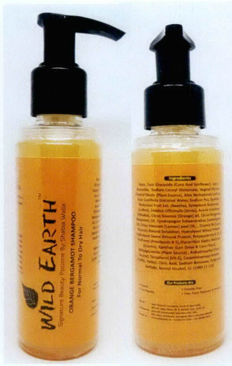
Figure 2. Unnotified Wild Earth™ Signature Potions by Shabia Walia Orange Bergamot Shampoo