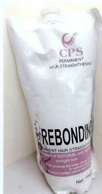
Figure 5. Unnotified CPS Permanent Hair Straightening