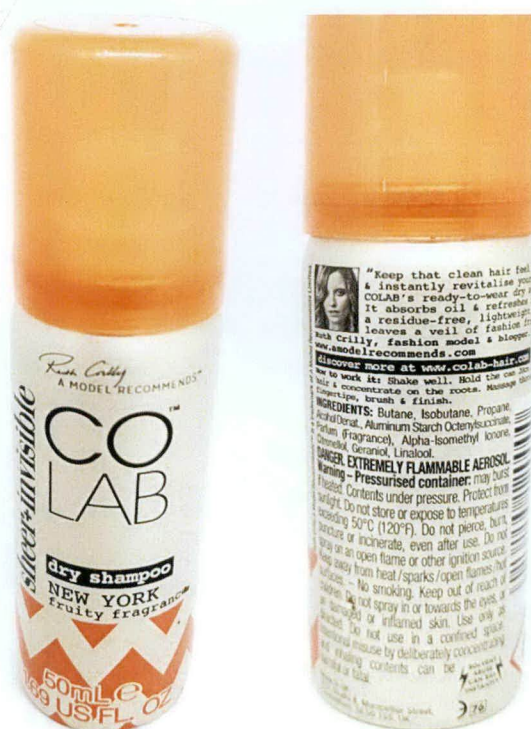
Figure 1. Unnotified CO™ Lab Dry Shampoo New York Sheer + Invisible

The Food and Drug Administration (FDA) warns the public from purchasing and using the following unnotified cosmetic products: