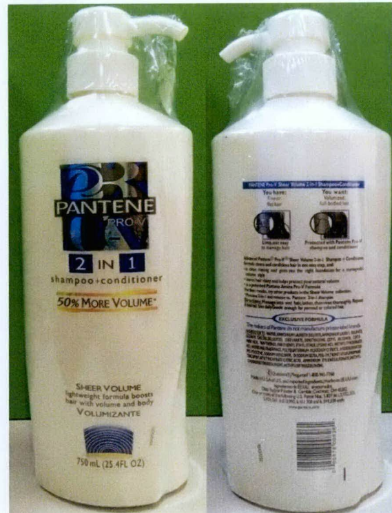
Figure 3. Unnotified Pantene Pro-V Sheer Volume 2 in 1 Shampoo + Conditioner