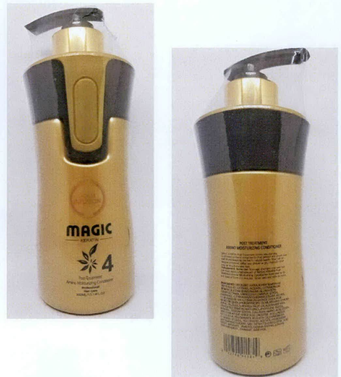
Figure 5. Unnotified Magic Keratin Gold Infusion 4 Post-Treatment Amino Moisturizing Conditioner Professional Hair