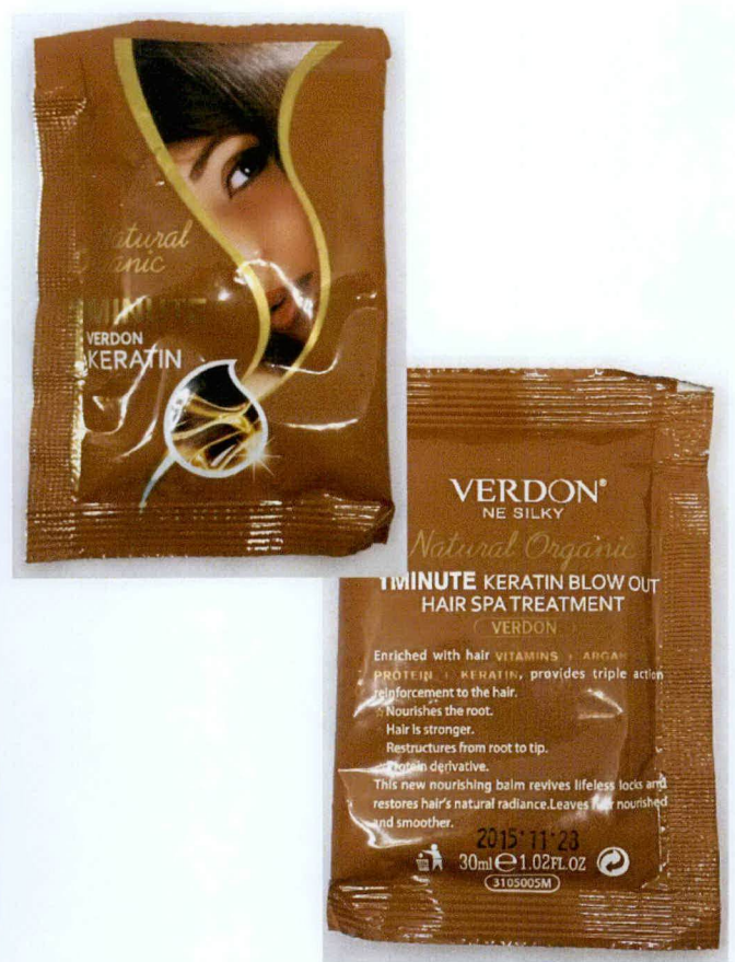
Figure 3. Unnotified Verdon® Ne Silky Natural Organic 1 Minute Keratin Blowout Hair Spa Treatment