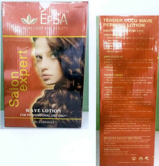
Figure 4. Unnotified EPSA® More Light and Beauty Salon Expert