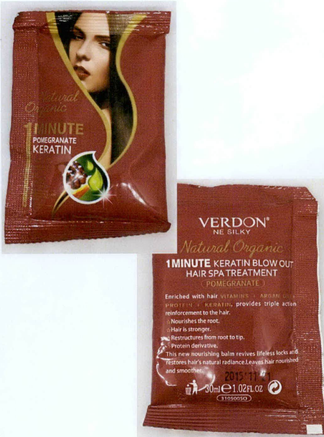
Figure 2. Unnotified Verdon® Ne Silky Natural Organic 1 Minute Keratin Blowout Hair Spa Treatment Pomegranate