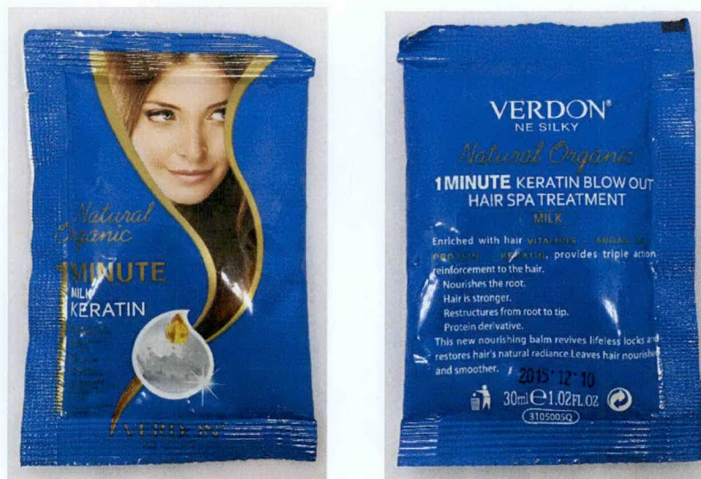
Figure 1. Unnotified Verdon® Ne Silky Natural Organic 1 Minute Keratin Blowout Hair Spa Treatment Milk

The Food and Drug Administration (FDA) warns the public from purchasing and using the following unnotified cosmetic products: