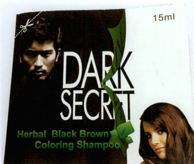
Figure 3. Unnotified Dark Secret Herbal Black Brown Coloring Shampoo