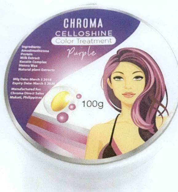
Figure 5. Unnotified Chroma Celloshine Color Treatment (Purple)