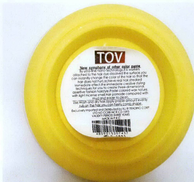
Figure 1. Unnotified TOV Hair Color Wax Variant6: T-1601