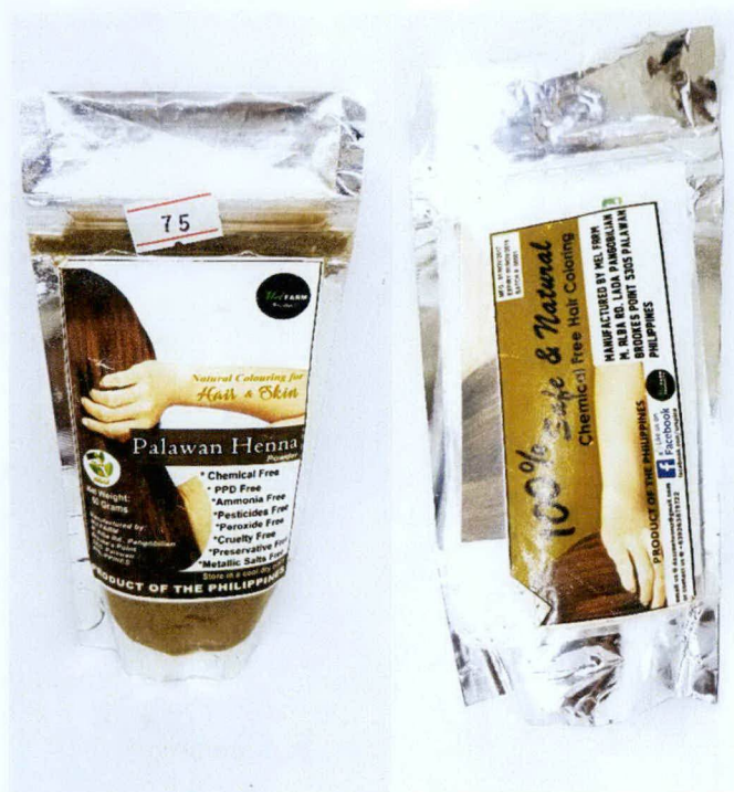
Figure 4. Unnotified Palawan Henna Powder