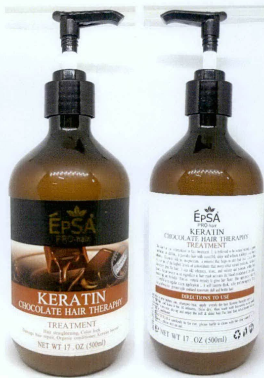
Figure 5. Unnotified EPSA® Pro-Hair Keratin Chocolate Hair Therapy Treatment