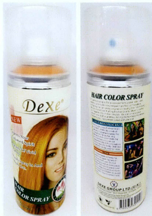
Figure 3. Unnotified Dexe® Hair Color Spray Orange