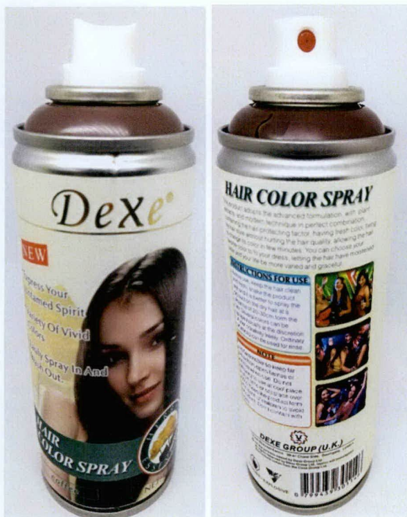
Figure 4. Unnotified Dexe® Hair Color Spray Coffee