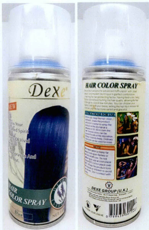
Figure 2. Unnotified Dexe® Hair Color Spray Blue