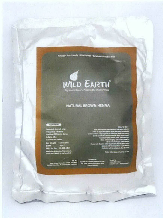
Figure 1. Unnotified Wild Earth™ Signature Potions by Shabia Walia Natural Brown Henna

The Food and Drug Administration (FDA) warns the public from purchasing and using the following unnotified cosmetic products: