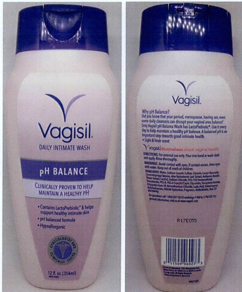
Figure 1. Counterfeit Vagisil® Daily Intimate Wash pH Balance

The Food and Drug Administration (FDA) warns the public from purchasing and using the below counterfeit cosmetic product: