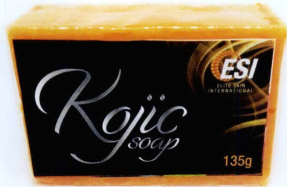
Figure 3. Unnotified Elite Skin International Kojic Soap