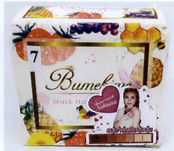
Figure 5. Unnotified Bumbime Mask Natural Soap

The FDA verified through post-marketing surveillance (PMS) that the abovementioned cosmetic products are not authorized and the Certificates of Product Notification have not been issued. Pursuant to Republic Act No. 9711, otherwise known as the “Food and Drug Administration Act of 2009”, the manufacture, importation, exportation, sale, offering for sale, distribution, transfer, non-consumer use, promotion, advertising or sponsorship of health products without the proper authorization from FDA is prohibited.