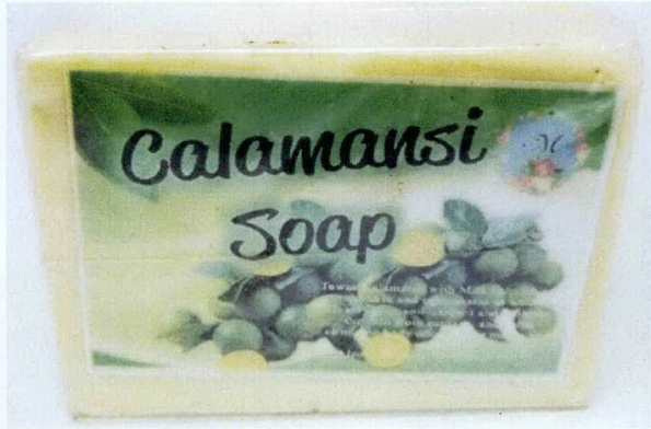
Figure 2. Unnotified M Calamansi Soap