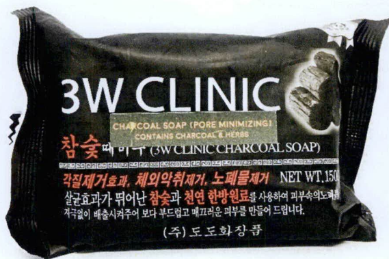
Figure 4. Unnotified 3W Clinic Charcoal Soap