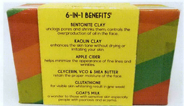
Figure 1. Unnotified The Retro Healing Bentonite Clay Soap