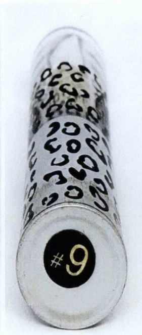
Figure 2. Unnotified AS Ashley Lipstick (#9)