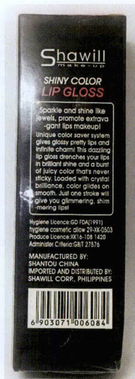
Figure 4. Unnotified Shawill Make-up Shiny Color Lip Gloss (004)