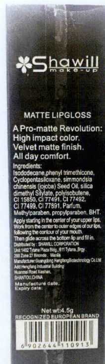
Figure 5. Unnotified Shawill Make-Up Premium Mineral Matte Lipgloss (5)