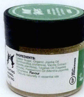
Figure 3. Unnotified Fresh Handmade Cosmetics Mint Julips Lip Scrub Lush