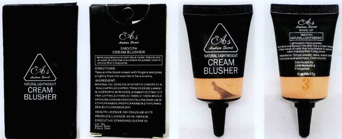
Figure 1. Unnotified AS Andrea Secret Smooth Cream Blusher (3)

The Food and Drug Administration (FDA) warns the public from purchasing and using the following unnotified cosmetic products: