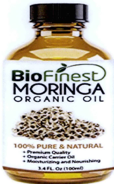
Figure 1. Unregistered Biofinest Moringa Organic Oil, 100% Pure And Natural

The Food and Drug Administration (FDA) warns the public from purchasing and consuming the following unregistered food supplements: