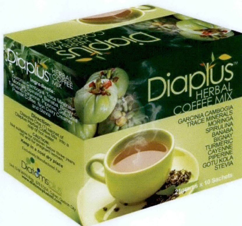
Figure 3. Unregistered Diatomsplus International Diaplus Herbal Coffee Mix