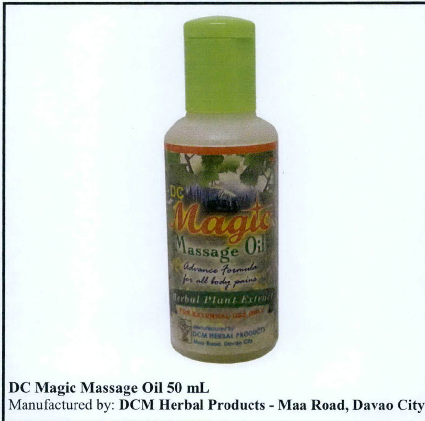
DC Magic Massage Oil 50 mL Manufactured by: DCM Herbal Products - Maa Road, Davao City

The Food and Drug Administration (FDA) advises the public against the purchase and use of the unregistered drug product: