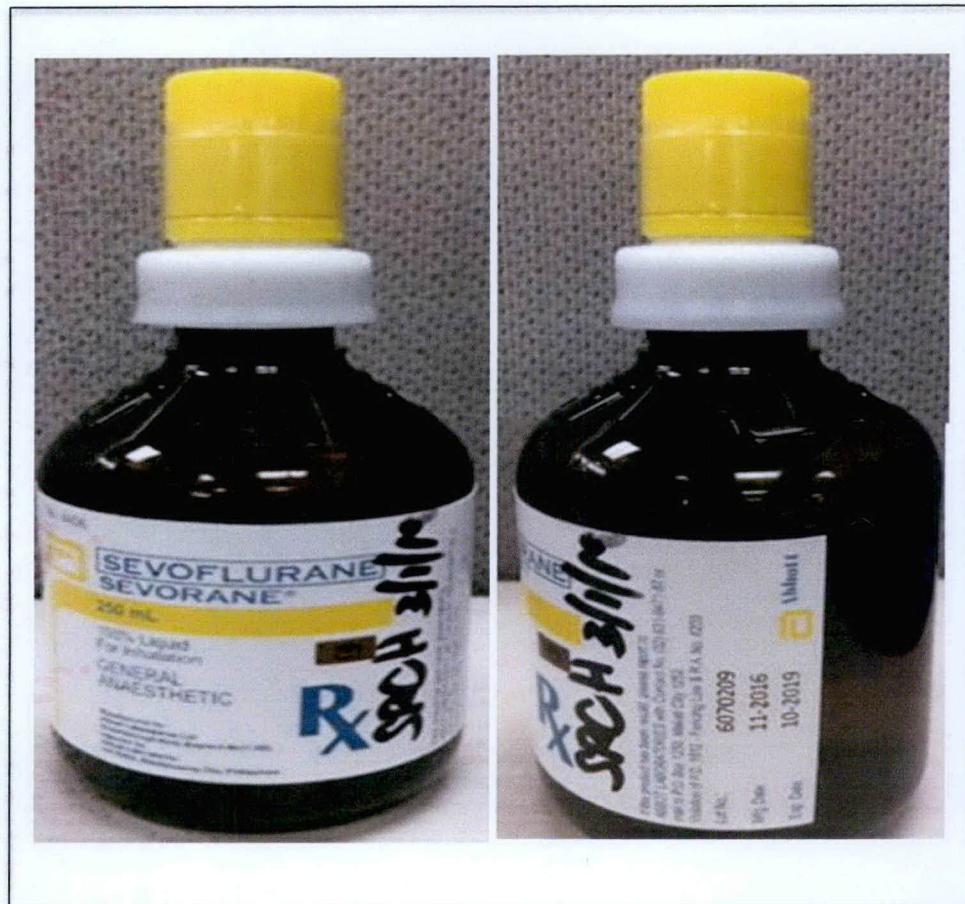
Figure 1. Counterfeit/fake version of Sevoflurane (Sevorane) 100% Liquid for Inhalation

The Food and Drug Administration (FDA) advises the public against the purchase and use of the counterfeit/fake version of Sevoflurane (Sevorane) 100% Liquid for Inhalation (Wet Formulation):