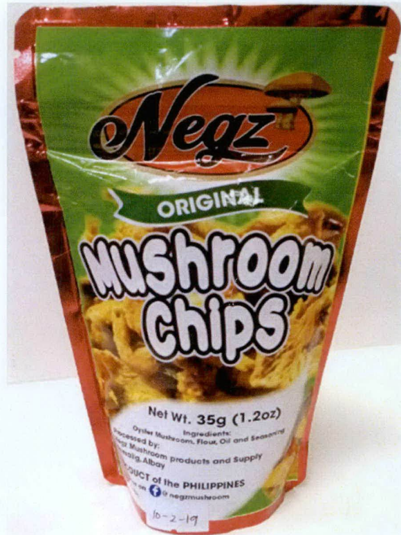
Figure 5. Unregistered NEGZ Original Mushroom Chips