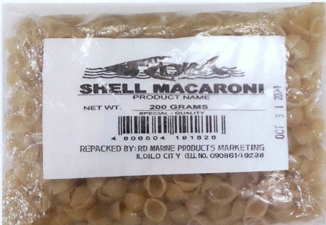
Figure 1. Unregistered RDM Shell Macaroni

The Food and Drug Administration (FDA) warns the public from purchasing and consumption of the following unregistered food products: