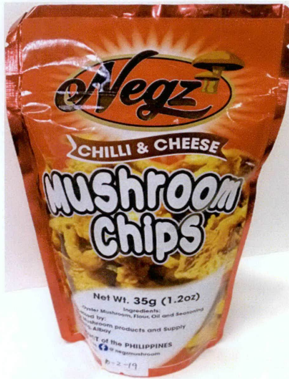
Figure 3. Unregistered NEGZ Chili & Cheese Mushroom Chips