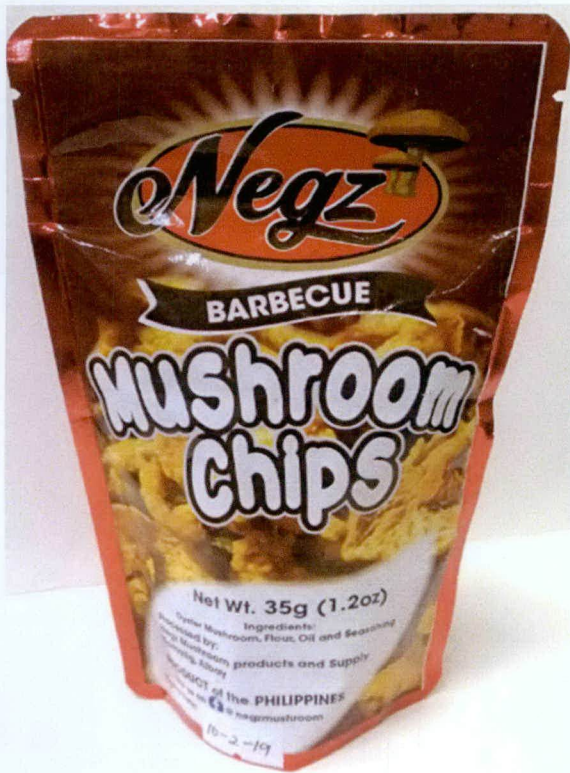
Figure 4. Unregistered NEGZ Barbeque Mushroom Chips