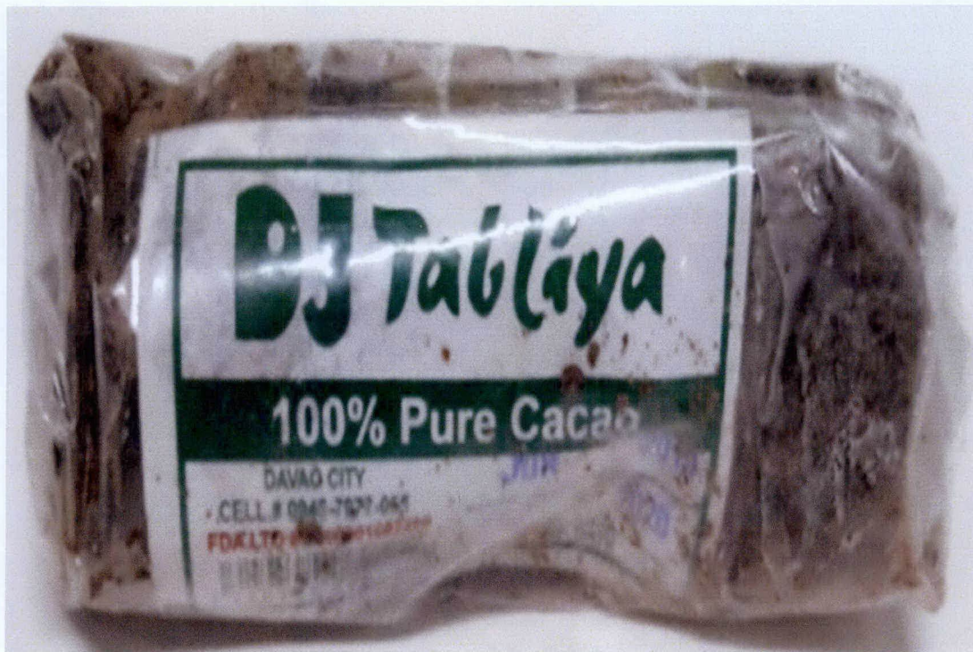
Figure 1. Unregistered DJ TABLIYA 100% Pure Cacao

The Food and Drug Administration (FDA) warns the public from purchasing and consumption of the following unregistered food products: