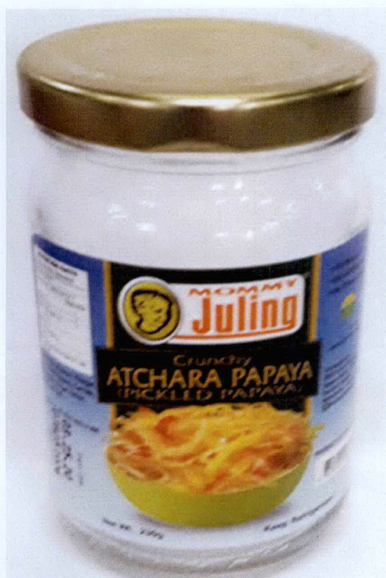
Figure 4. Unregistered Mommy Juling Crunchy Atchara Papaya (Pickled Papaya)