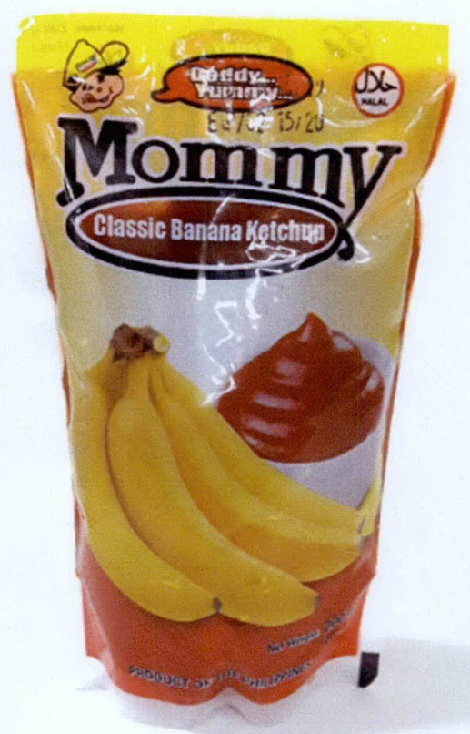
Figure 5. Unregistered Daddy Yummy Mommy Classic Banana Ketchup