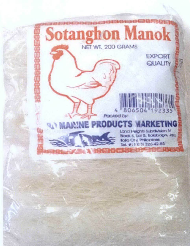
Figure 3. Unregistered Sotanghon Manok