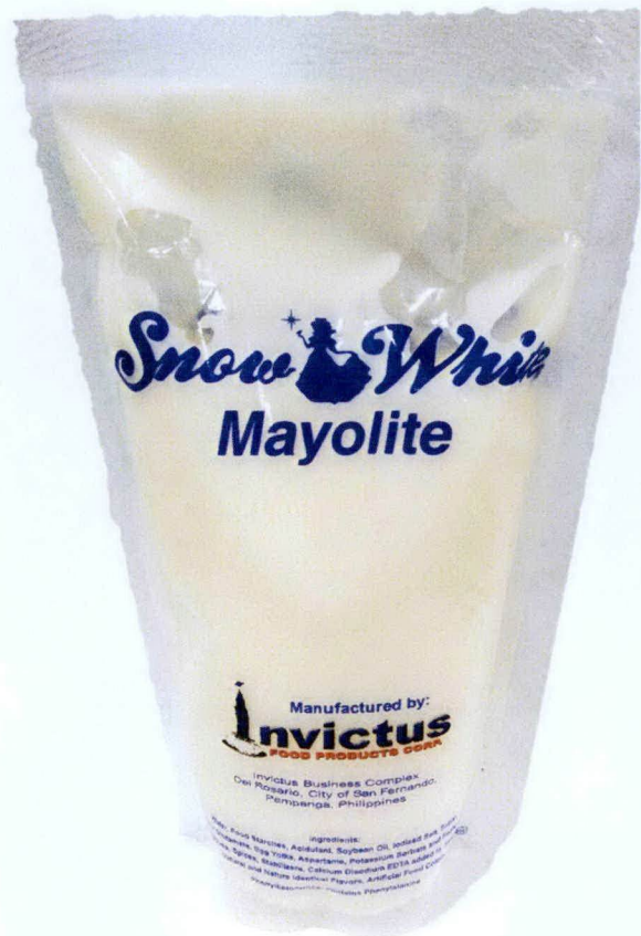
Figure 5. Unregistered SNOW WHITE Mayolite (Pouch)