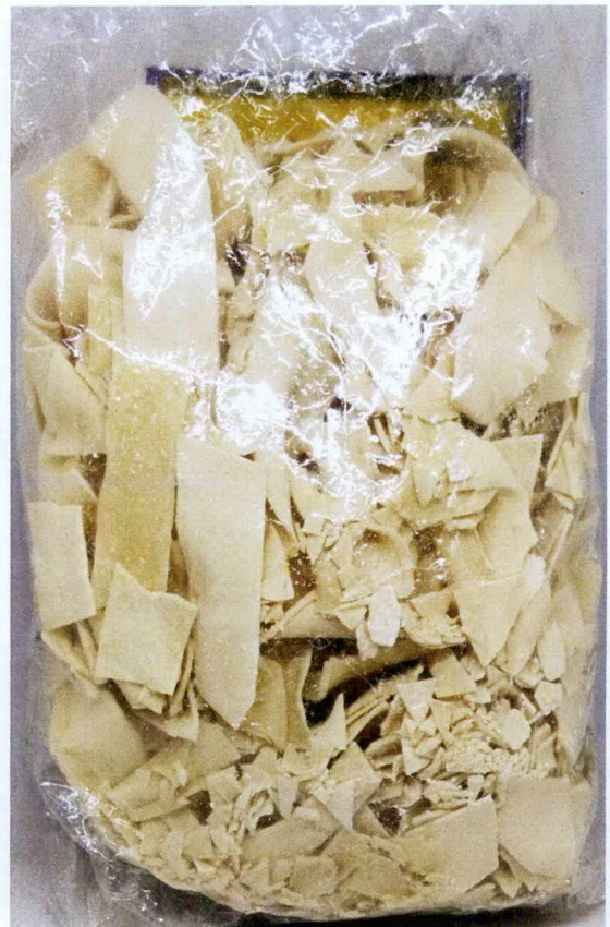
Figure 4. Unregistered PABO® Pancit Molo Strips (200 grams)