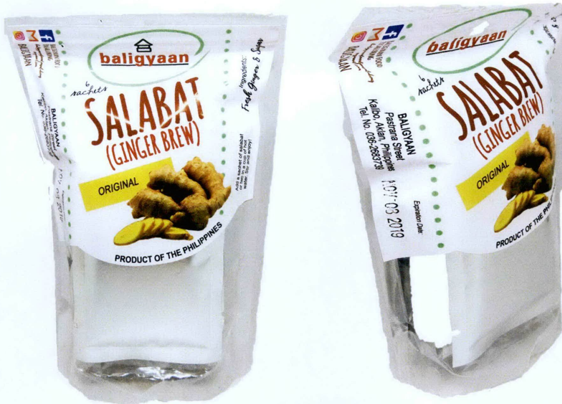
Figure 2. Unregistered BALIGYAAN Salabat Ginger Brew Original (6 sachets per pouch)