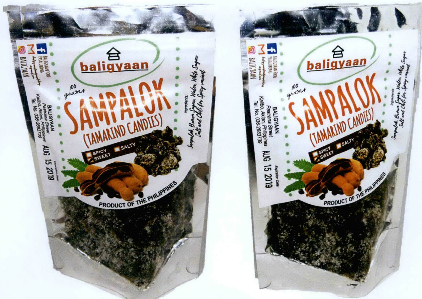
Figure 3. Unregistered BALIGYAAN Sampalok (Tamarind Candies) Sweet Flavor (100 grams)