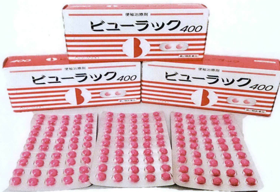
Figure 1. Unregistered KOKANDO BYURAKKU Corac Diet Pills (50 tablets x box)

The Food and Drug Administration (FDA) warns the public from purchasing and consuming the following unregistered food products & food supplements: