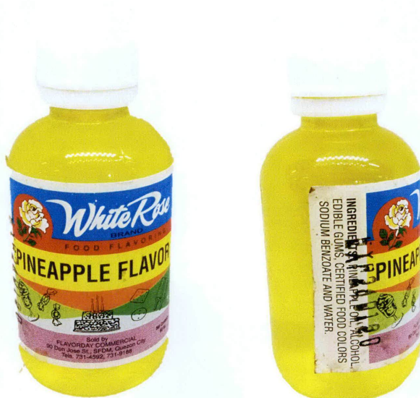
Figure 3. Unregistered WHITE ROSE BRAND Food Flavoring Pineapple Flavor (60mL x bottle)