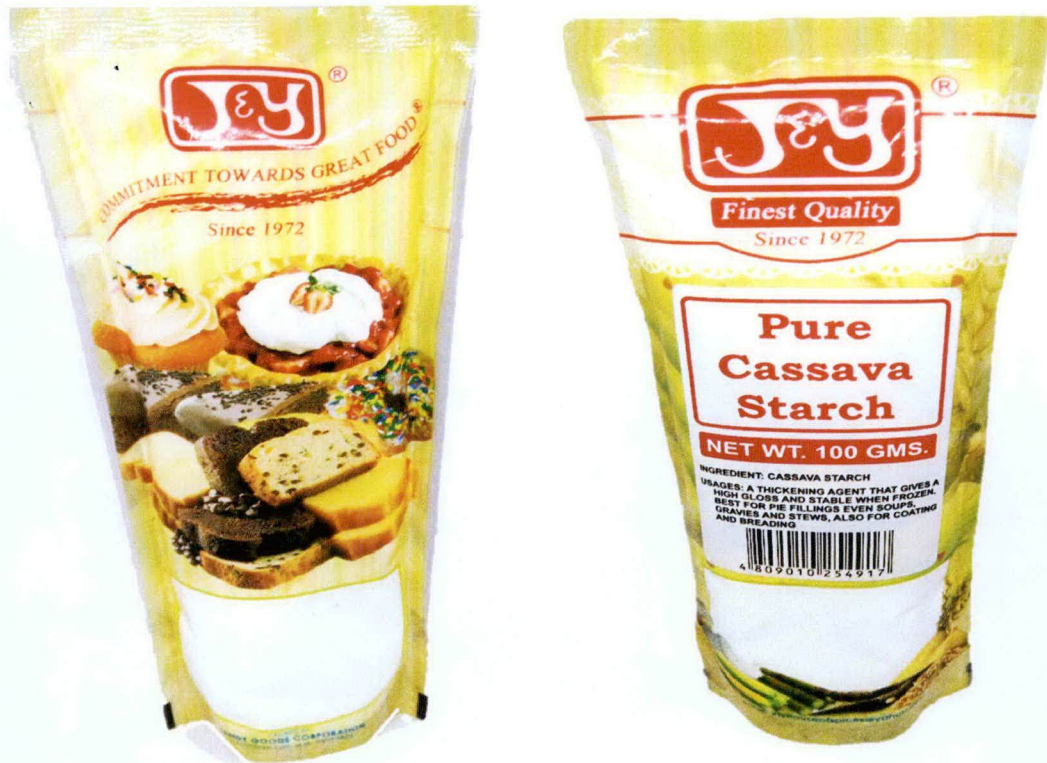
Figure 2. Unregistered J & Y Pure Cassava Starch (100 grams x pack)