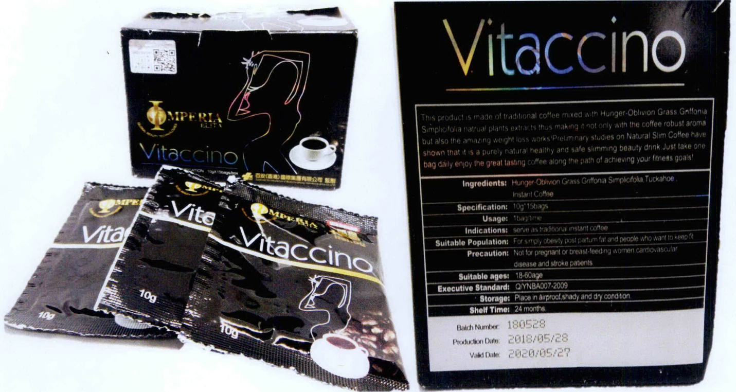
Figure 4. Unregistered BAIAN LISHOU IMPERIA ELITA Vitaccino Slimming Coffee (10grams x 15bags x box)