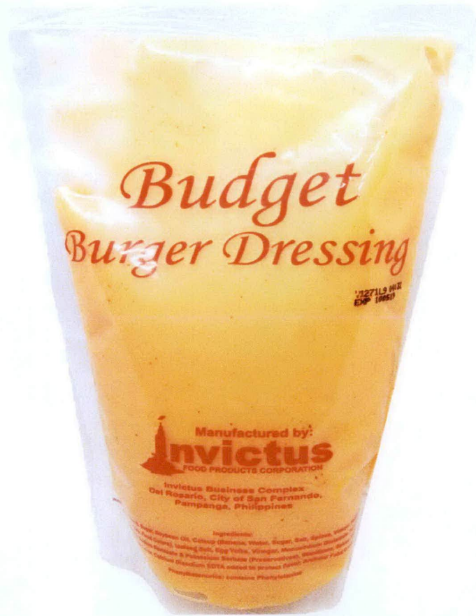
Figure 2. Unregistered BUDGET Burger Dressing (Pouch)