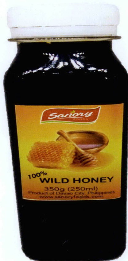
Figure 3. Unregistered SANORY FOODS 100% Wild Honey (350 grams x bottle)