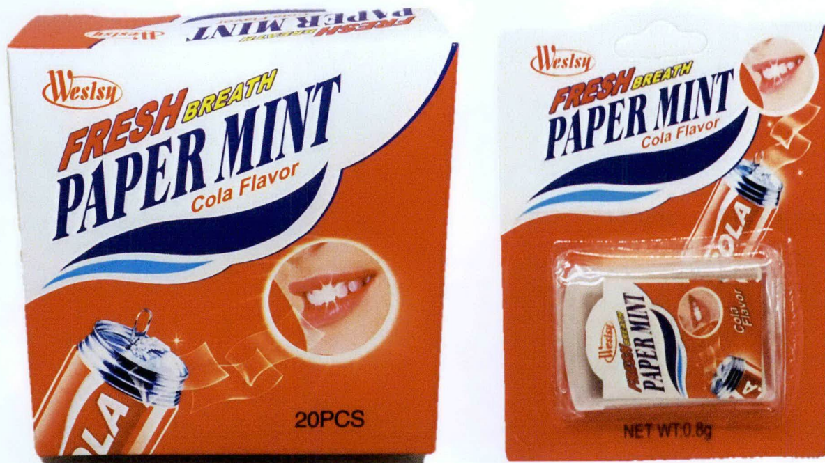
Figure 5. Unregistered WESLSY Fresh Breath Paper Mint Cola Flavor (20 pcs)