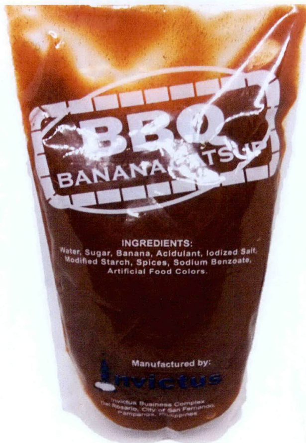
Figure 1. Unregistered BBQ Banana Catsup (Pouch)

The Food and Drug Administration (FDA) warns the public from purchasing and consuming the following unregistered food products: