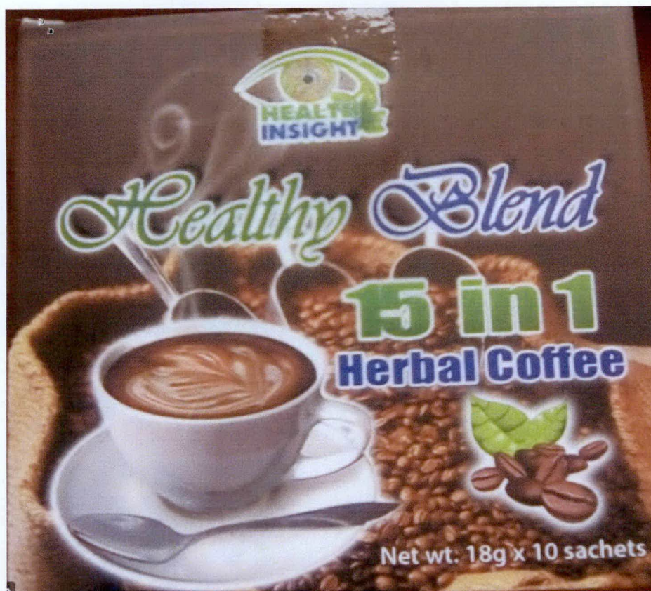
Figure 2. Unregistered HEALTHY BLEND 15 in 1 Herbal Café

The FDA verified through post-marketing surveillance that the abovementioned food products are not registered and the Certificate of Product Registration (CPR) have not yet been issued. Pursuant to the Republic Act No. 9711, otherwise known as the “Food and Drug Administration Act of 2009”, the manufacture, importation, exportation, sale, offering for sale, distribution, transfer, non-consumer use, promotion, advertising or sponsorship of health products without the proper authorization is prohibited.