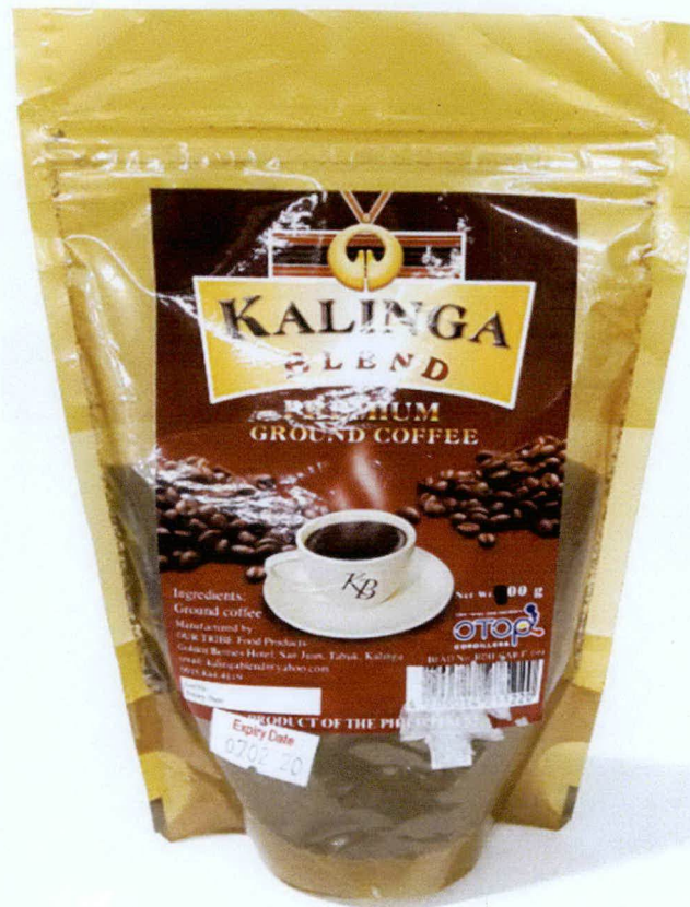
Figure 1. Unregistered KALINGA BLEND Premium Ground Coffee

The Food and Drug Administration (FDA) warns the public from purchasing and consumption of the following unregistered food products: