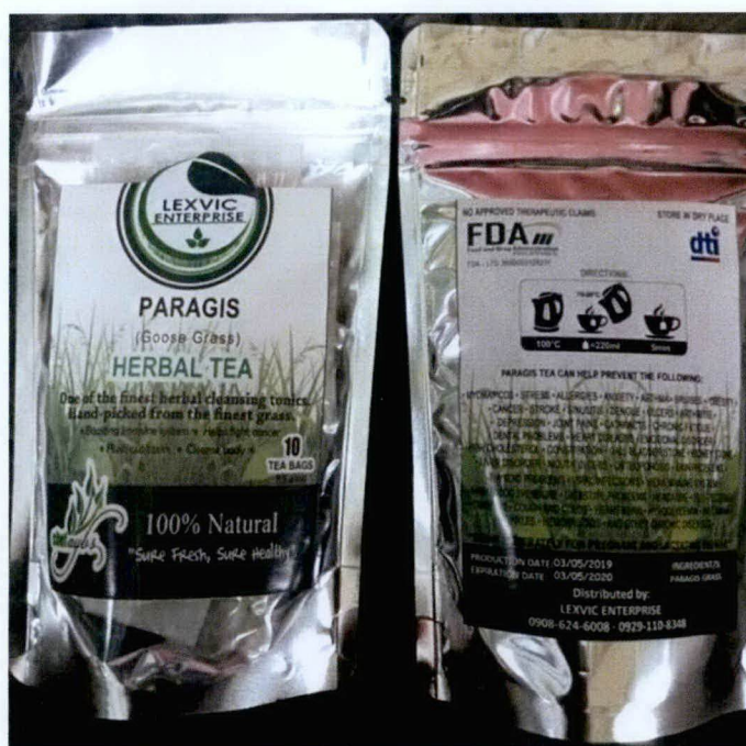
Figure 5. Unregistered LEXVIC ENTERPRISE Paragis (Goosegrass) Herbal Tea

The FDA verified through post-marketing surveillance that the abovementioned food supplement and food products are not authorized and the Certificates of Product Registration (CPR) have not been issued. Pursuant to the Republic Act No. 9711, otherwise known as the “Food and Drug Administration Act of 2009”, the manufacture, importation, exportation, sale,