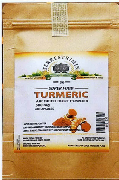
Figure 4. Unregistered TERRESTRIMIN SUPER FOOD Turmeric Air Dried Root Powder Dietary Supplement