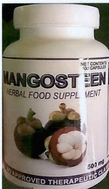
Figure 1. Unregistered PAZ HERBAL Mangosteen Herbal Food Supplement

The Food and Drug Administration (FDA) advises the public from purchasing and consumption of the following unregistered food supplement and food products: