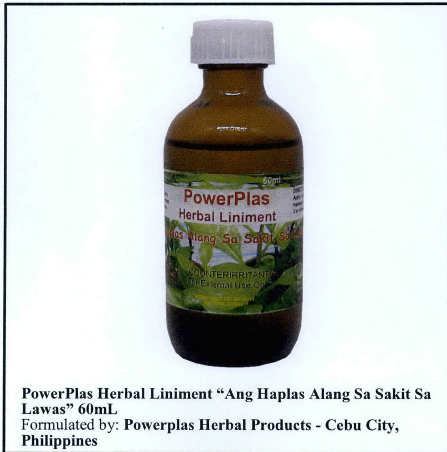
Figure 1. Unregistered drug product

The Food and Drug Administration (FDA) advises the public against the purchase and use of the unregistered drug product: