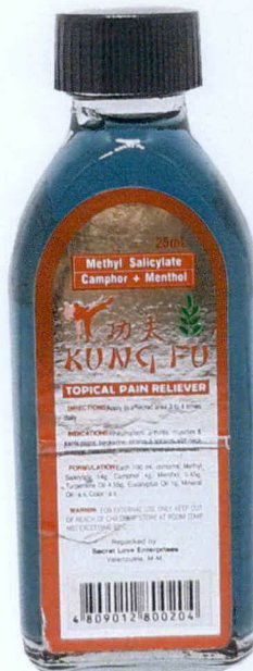
Methyl Salicylate + Camphor + Menthol (KUNG FU) Topical Pain Reliever 25mL Repacked by: Secret Love Enterprises - Valenzuela M.M.