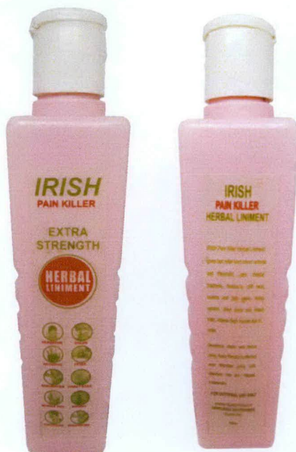
IRISH PAIN KILLER EXTRA STRENGTH HERBAL LINIMENT 150mL Another Quality Product of Chrisjecel Enterprises – Quezon City