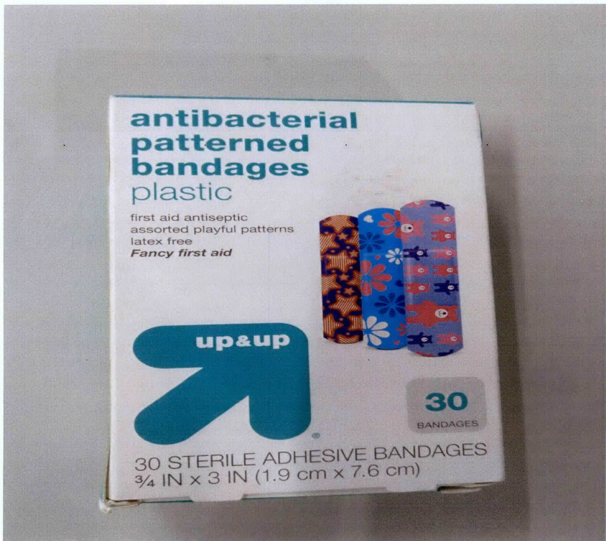
Figure 1. Unregistered Antibacterial Patterned Bandages Plastic

The Food and Drug Administration (FDA) warns all concerned healthcare professionals and the public against the purchase and use of the unregistered medical device: