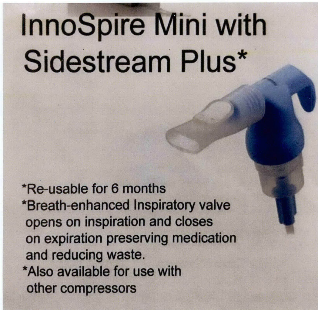
Figure 1. Unregistered Innospire Mini with Sidestream Plus

The Food and Drug Administration (FDA) warns all healthcare professionals and the general public against the purchase and use of the unregistered medical device: