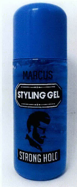
Figure 4. Unnotified Marcus Styling Gel Strong Hold