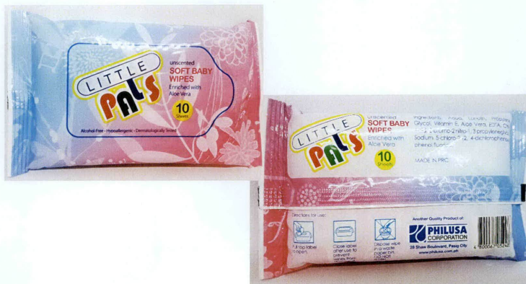
Figure 1. Unnotified Little Pals Unscented Soft Baby Wipes Enriched with Aloe Vera

The Food and Drug Administration (FDA) warns the public from purchasing and using the following unnotified cosmetic products: