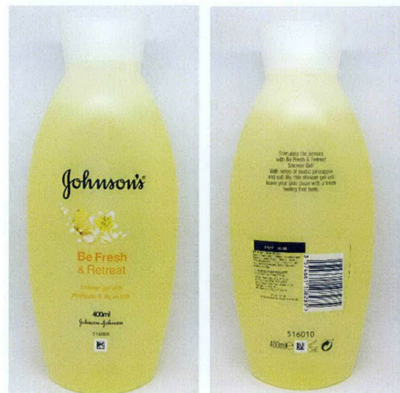
Figure 5. Unnotified Johnson's® Be Fresh & Retreat Shower Gel With Pineapple & Lily Aroma

The FDA verified through post-marketing surveillance (PMS) that the abovementioned cosmetic products are not authorized and the Certificates of Product Notification have not been issued. Pursuant to Republic Act No. 9711, otherwise known as the “Food and Drug Administration Act of 2009”, the manufacture, importation, exportation, sale, offering for sale, distribution, transfer, non-consumer use, promotion, advertising or sponsorship of health products without the proper authorization from FDA is prohibited.