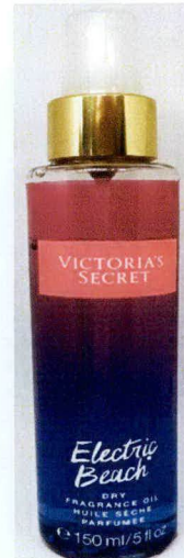
Figure 3. Unnotified Victoria's Secret Fragrance Oil Electric Beach