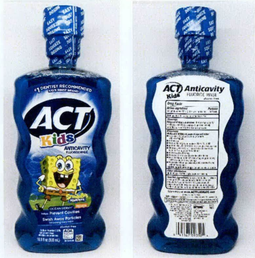
Figure 2. Unnotified ACT® Kids Anticavity Fluoride Rinse Ocean Berry®