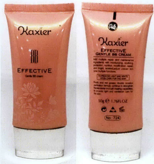
Figure 4. Unnotified Kaxier BB Effective Gentle BB Cream (04)