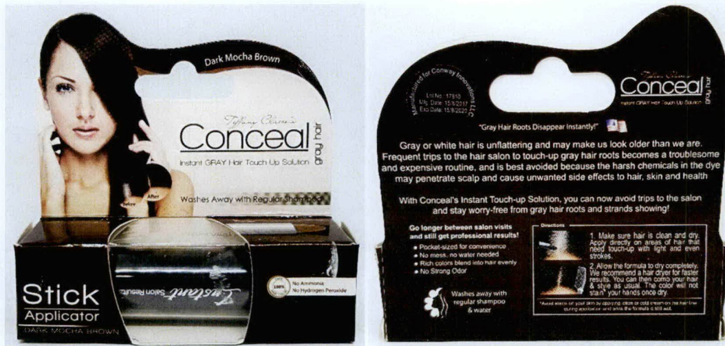
Figure 1. Unnotified Tiffany Claire's Conceal Instant Gray Hair Touch-Up Solution (Dark Mocha Brown)

The Food and Drug Administration (FDA) warns the public from purchasing and using the following unnotified cosmetic products: