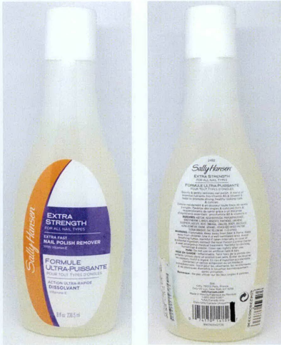
Figure 2. Unnotified Sally Hansen Extra Strength Extra Fast Nail Polish Remover with Vitamin E