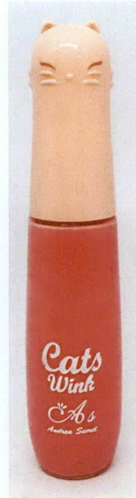
Figure 3. Unnotified Andrea Secret Cat Wink (3)