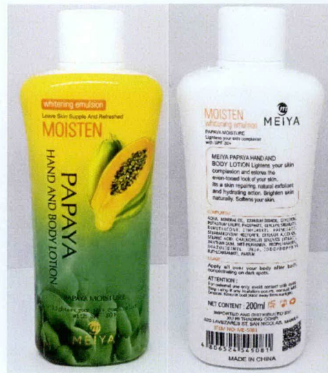
Figure 5. Unnotified Meiya Hand and Body Lotion Papaya with SPF 30+ (ME-5081)

The FDA verified through post-marketing surveillance (PMS) that the abovementioned cosmetic products are not authorized and the Certificates of Product Notification have not been issued. Pursuant to Republic Act No. 9711, otherwise known as the “Food and Drug Administration Act of 2009”, the manufacture, importation, exportation, sale, offering for sale, distribution, transfer, non-consumer use, promotion, advertising or sponsorship of health products without the proper authorization from FDA is prohibited.