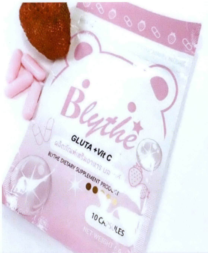
Figure 3 Unregistered BLYTHE Gluta+Vit C Dietary Supplement

The FDA verified through post-marketing surveillance that the above mentioned food supplements are not authorized and the Certificates of Product Registration have not been issued. Pursuant to the Republic Act No. 9711, otherwise known as the “Food and Drug Administration Act of 2009”, the manufacture, importation, exportation, sale, offering for sale, distribution, transfer, non-consumer use, promotion, advertising or sponsorship of health products without the proper authorization is prohibited.