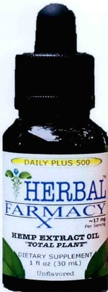
Figure 2. Unregistered DAILY PLUS 500 Herbal Farmacy Hemp Extract Oil Dietary Supplement