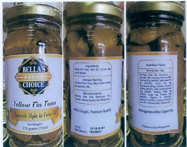
Figure 3. Unregistered BELLA'S CHOICE Yellowfin Tuna Spanish Style In Corn Oil