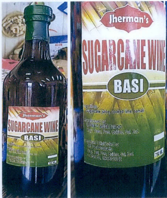
Figure 2. Unregistered JHERMAN'S Sugarcane Wine Basi