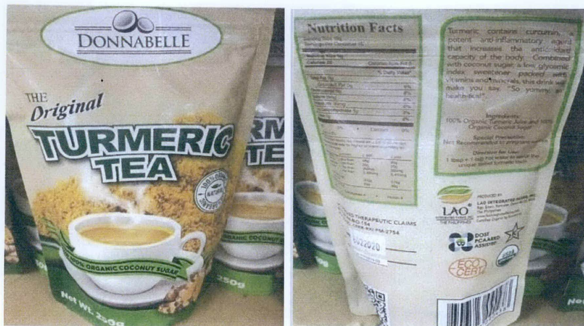
Figure 1. Unregistered DONNABELLE The Original Turmeric Tea

The Food and Drug Administration (FDA) warns the public from purchasing and consumption of the following unregistered food products: