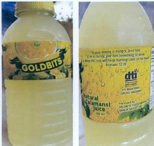
Figure 4. Unregistered GOLDBITS Natural Calamansi Juice