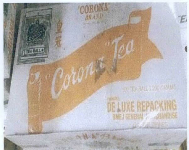
Figure 5. Unregistered CORONA TEA BALL Corona Tea

The FDA verified through post-marketing surveillance that the abovementioned food products are not registered and the Certificate of Product Registration (CPR) have not yet been issued. Pursuant to the Republic Act No. 9711, otherwise known as the "Food and Drug Administration Act of 2009", the manufacture, importation, exportation, sale, offering for sale, distribution, transfer, non-consumer use, promotion, advertising or sponsorship of health products without the proper authorization is prohibited