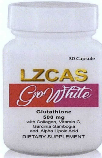
Figure 3. Unregistered LZCAS GO WHITE Glutathione with Collagen, Vitamin C, Garcinia Cambogia and Alpha Lipoic Acid Dietary Supplement