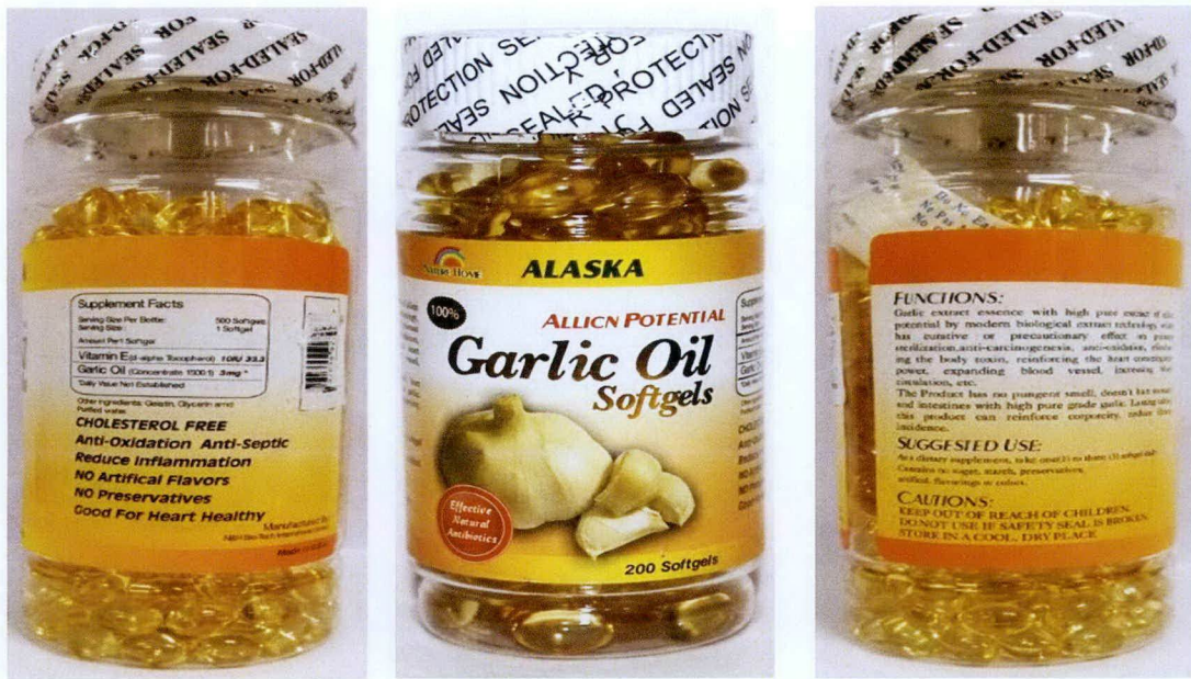
Figure 4. Unregistered NATURE HOME ALASKA ALLICIN POTENTIAL 100% Garlic Oil Softgels