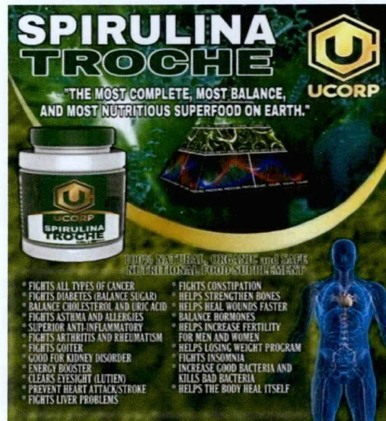
Figure 1. Unregistered UCORP Spirulina Troche Tablet

The Food and Drug Administration (FDA) advises the public from purchasing and consumption of the following unregistered food supplements: