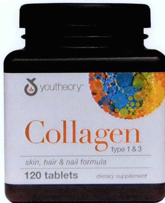
Figure 5. Unregistered YOUTHEORY Collage Type 1 & 3 Dietary Supplement, Tablets

The FDA verified through post-marketing surveillance that the abovementioned food supplements are not authorized and the Certificates of Product Registration (CPR) have not been issued. Pursuant to the Republic Act No. 9711, otherwise known as the “Food and Drug Administration Act of 2009”, the manufacture, importation, exportation, sale, offering for sale,