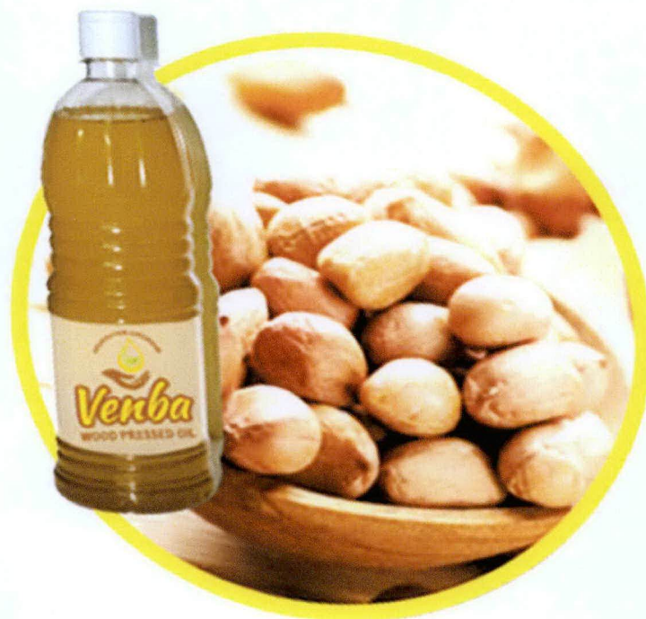
Figure 1. Unregistered VENBA Ground Nut Oil

The Food and Drug Administration (FDA) advises the public from purchasing and consumption of the following unregistered food products: