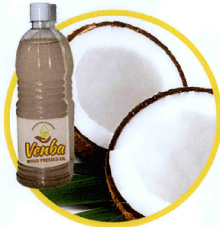
Figure 3. Unregistered VENBA Coconut Oil