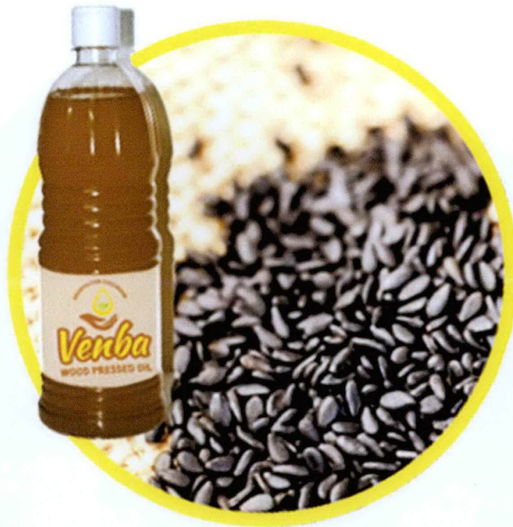
Figure 2. Unregistered VENBA Sesame Oil