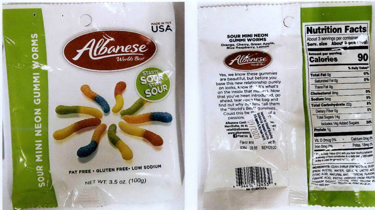
Figure 4. Unregistered ALBANESE WORLD'S BEST Sour Mini Neon Gummi Worms

The FDA verified through post-marketing surveillance that the abovementioned food products are not authorized and the Certificates of Product Registration (CPR) have not been issued. Pursuant to the Republic Act No. 9711, otherwise known as the "Food and Drug Administration Act of 2009", the manufacture, importation, exportation, sale, offering for sale, distribution, transfer, non-consumer use, promotion, advertising or sponsorship of health products without the proper authorization is prohibited.