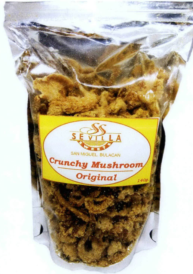
Figure 4. Unregistered SEVILLA SWEETS Crunchy Mushroom Original (140 grams x pouch)