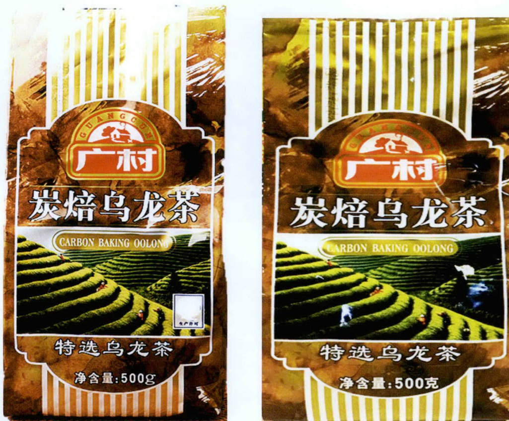
Figure 3. Unregistered GUANGCUN Oolong Tea (500 grams x pack)