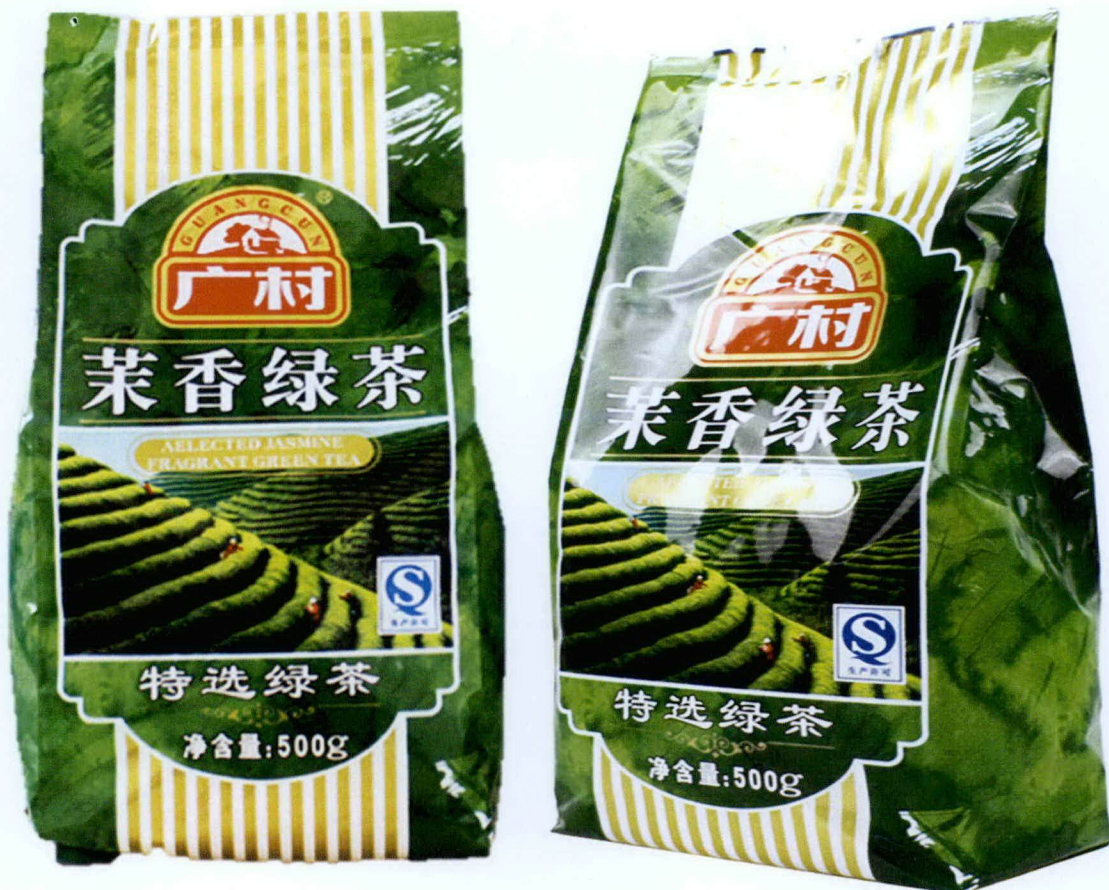
Figure 2. Unregistered GUANGCUN Jasmin Green Tea (500grams x pack)