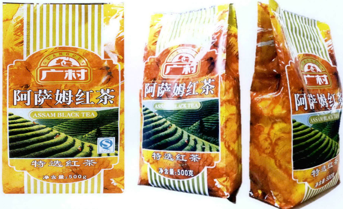
Figure 1. Unregistered GUANGCUN Assam Black Tea (500grams x pack)

The Food and Drug Administration (FDA) warns the public from purchasing and consuming the following unregistered food products: