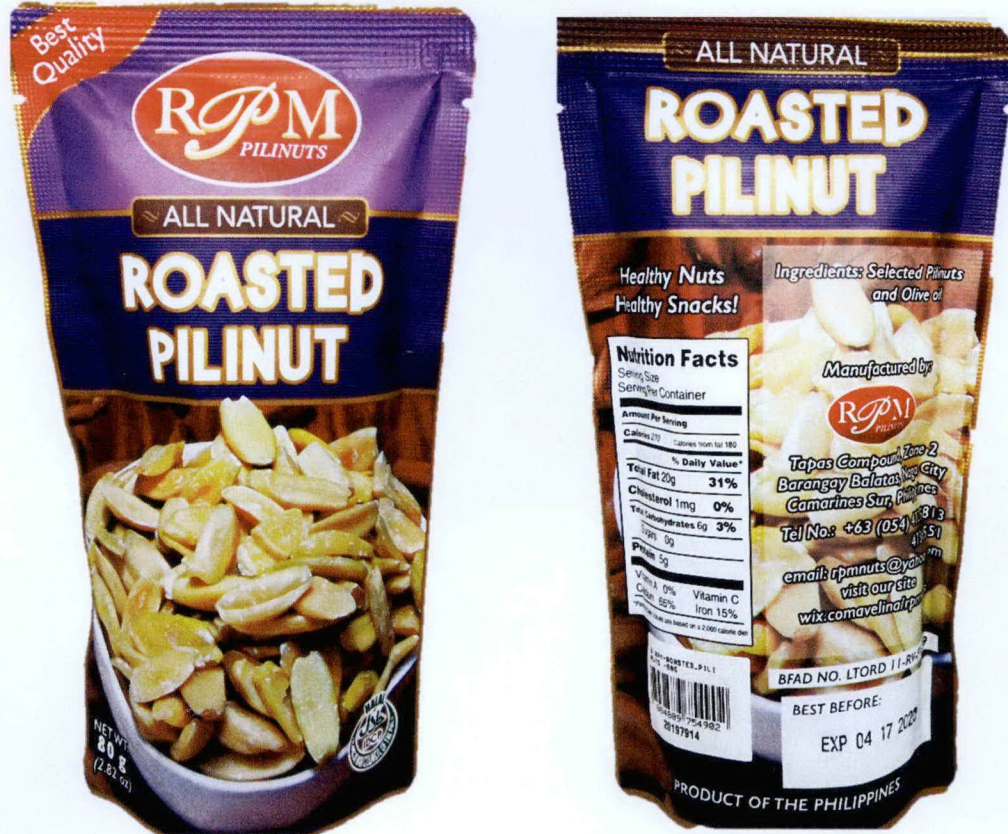
Figure 5. Unregistered RPM PILINUTS All Natural Roasted Pilinut 80 grams (2.82 oz.)