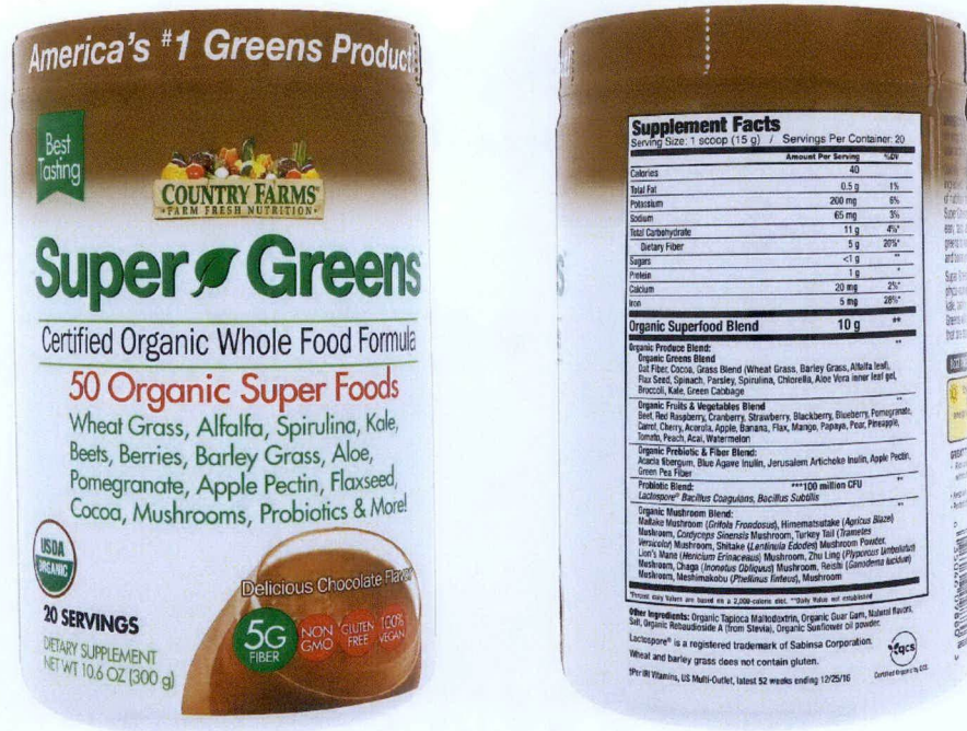
Figure 2. Unregistered COUNTRY FARMS SUPER GREENS Certified Organic Whole Food Formula –Delicious Chocolate Flavor Dietary Supplement

The FDA verified through post-marketing surveillance that the abovementioned food supplements are not authorized and the Certificates of Product Registration (CPR) have not been issued. Pursuant to the Republic Act No. 9711, otherwise known as the “Food and Drug Administration Act of 2009”, the manufacture, importation, exportation, sale, offering for sale, distribution, transfer, non-consumer use, promotion, advertising or sponsorship of health products without the proper authorization is prohibited.