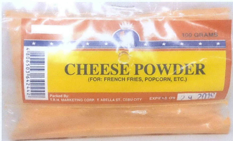
Figure 1. Unregistered JAN WIN'S General Merchandise Cheese Powder

The Food and Drug Administration (FDA) warns the public from purchasing and consumption of the following unregistered food products: