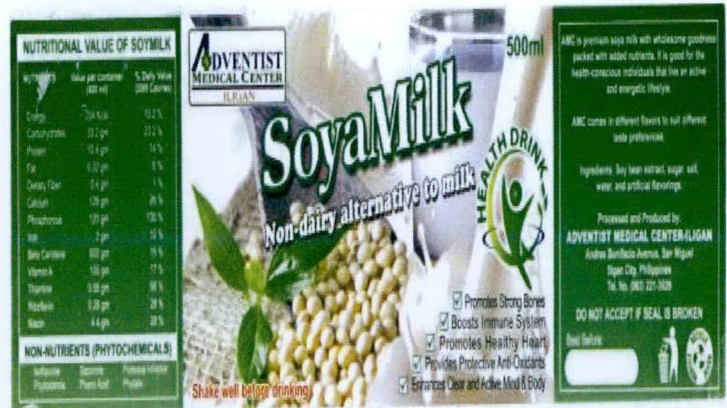
Figure 3. Unregistered ADVENTIST MEDICAL CENTER SoyaMilk Non-dairy Alternative to Milk

The FDA verified through post-marketing surveillance that the abovementioned food products are not registered and the Certificate of Product Registration (CPR) have not yet been issued. Pursuant to the Republic Act No. 9711, otherwise known as the “Food and Drug Administration Act of 2009”, the manufacture, importation, exportation, sale, offering for sale, distribution, transfer, non-consumer use, promotion, advertising or sponsorship of health products without the proper authorization is prohibited