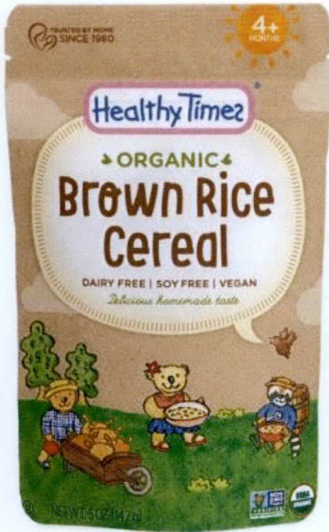
Figure 2. Unregistered HEALTHY TIMES™ Organic Brown Rice