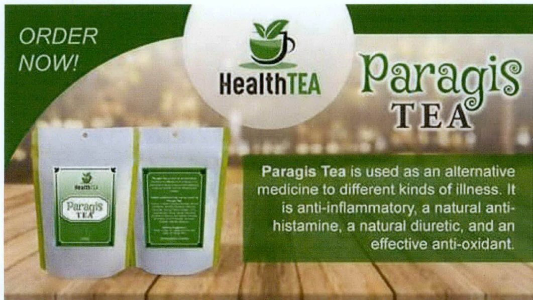
Figure 1. Sample Advertisement of Unregistered HEALTH TEA Paragis Tea

The Food and Drug Administration (FDA) warns the public from purchasing and consuming the following unregistered food products with unapproved advertisements and promotions: