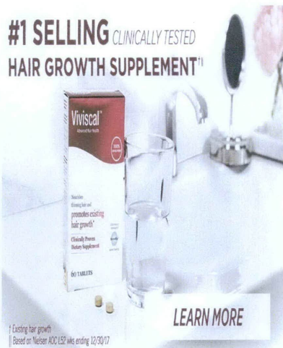
Figure 2. Sample Advertisement of Unregistered VIVISCAL Advanced