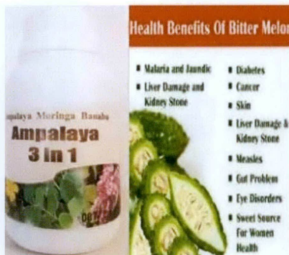
Figure 5. Sample Advertisement of Unregistered AMPALAYA 3 IN 1 Capsule

The FDA verified through post-marketing surveillance that the abovementioned food products are not registered and the Certificate of Product Registration (CPR) have not yet been issued. Pursuant to the Republic Act No. 9711, otherwise known as the “Food and Drug Administration Act of 2009”, the manufacture, importation, exportation, sale, offering for sale, distribution, transfer, non-consumer use, promotion, advertising or sponsorship of health products without the proper authorization is prohibited