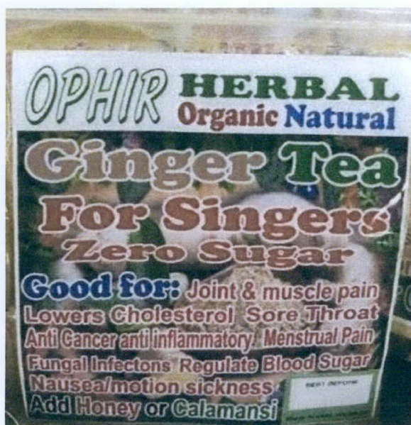
Figure 4. Sample Advertisement of Unregistered OPHIR Herbal Organic Natural Ginger Tea for Singers Zero Sugar