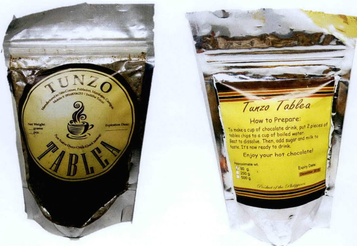
Figure 3. Unregistered TUNZO Pure Native Choco Chips Quick Melting Tablea (80grams)