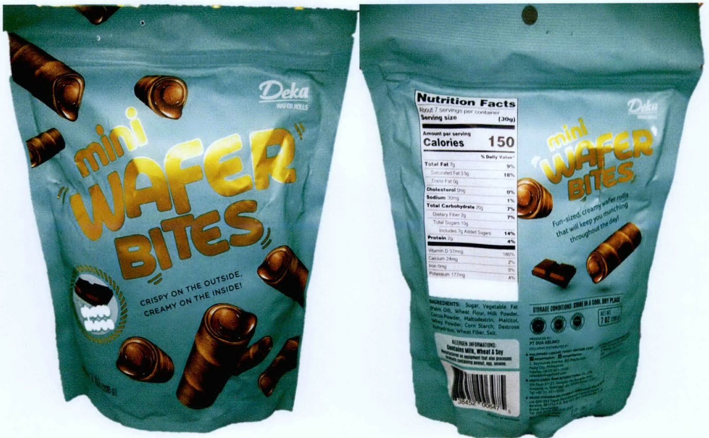
Figure 4. Unregistered DEKA WAFFER ROLLS Mini Wafer Bites Choco Choco 200 grams (7 oz.)