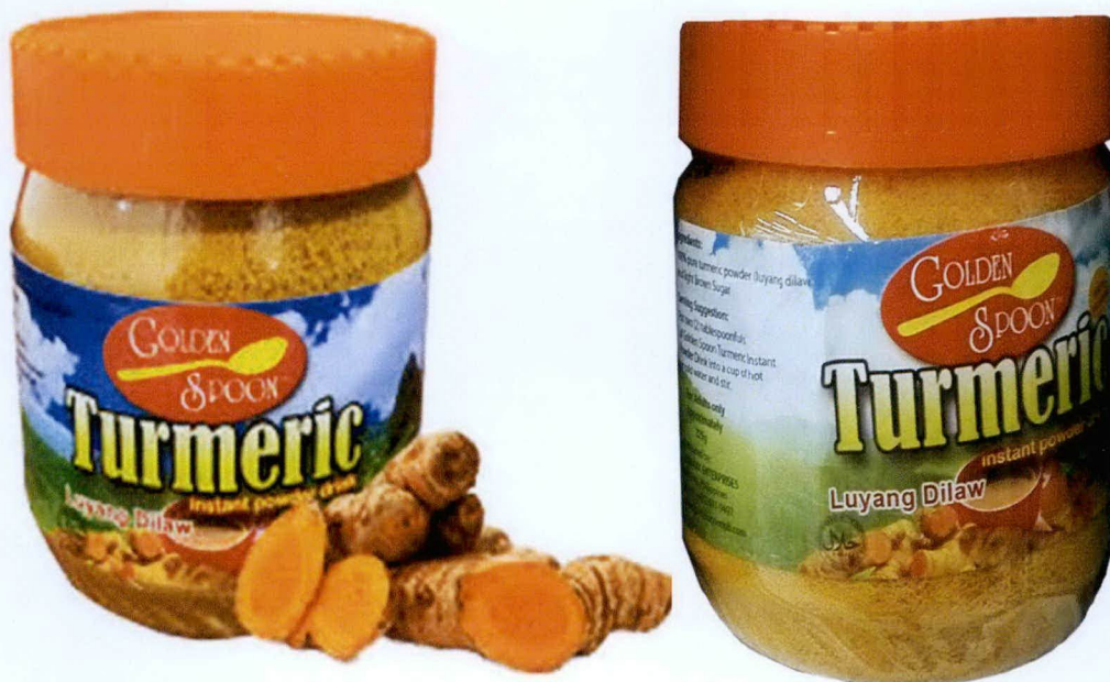
Figure 1. Unregistered GOLDEN SPOON Turmeric Instant Powdered Drink Luyang Dilaw (225 grams)

The Food and Drug Administration (FDA) warns the public from purchasing and consuming the following unregistered food products: