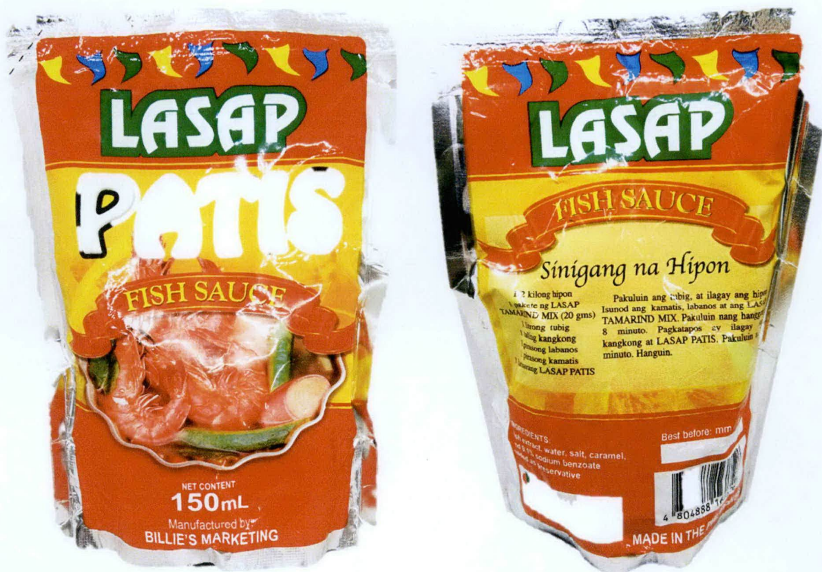
Figure 5. Unregistered LASAP PATIS Fish Sauce (150mL x Pouch)