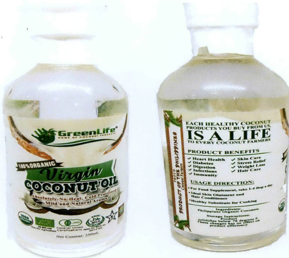
Figure 2. Unregistered GREENLIFE® HOME OF COCONUT PRODUCTS Organic Virgin Coconut Oil (250mL x bottle)