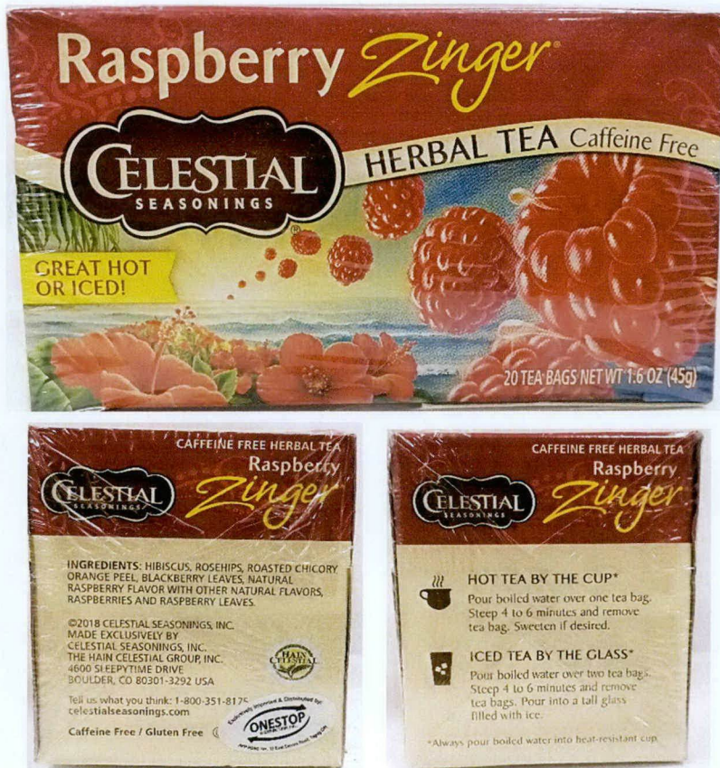
Figure 3. Unregistered CELESTIAL SEASONINGS Raspberry Zinger Herbal Tea Caffeine Free