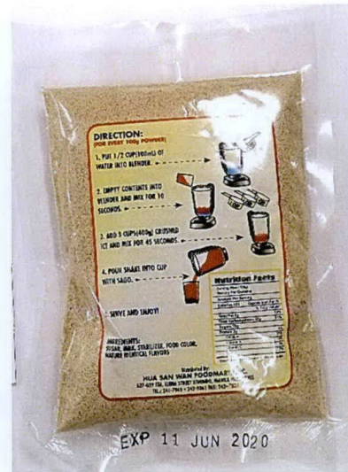
Figure 4. Unregistered FAT & THIN Icee! Pearl Shake Powder Cookies and Cream