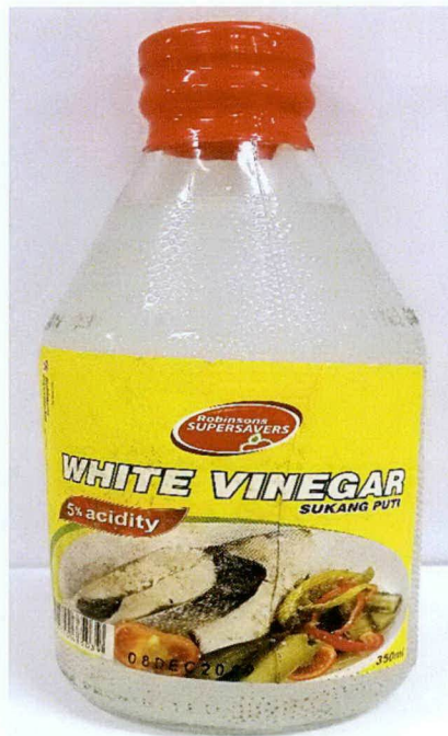
Figure 1. Unregistered ROBINSONS SUPERSAVERS White Vinegar 5% acidity

The Food and Drug Administration (FDA) advises the public from purchasing and consumption of the following unregistered food products: