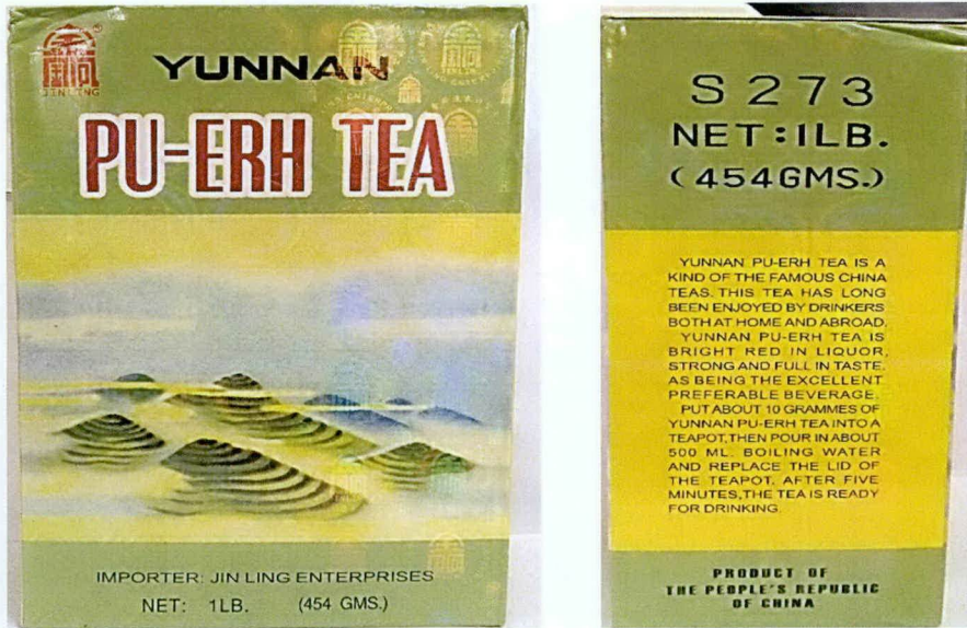
Figure 2. Unregistered JINLING YUNNAN Pu-erh Tea