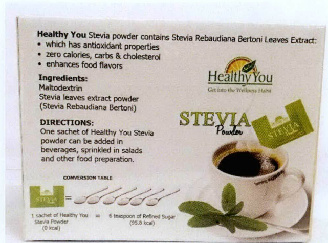
Figure 5. Unregistered HEALTHY YOU Stevia Powder

The FDA verified through post-marketing surveillance that the abovementioned food products are not authorized and the Certificates of Product Registration (CPR) have not been issued. Pursuant to the Republic Act No. 9711, otherwise known as the “Food and Drug Administration Act of 2009”, the manufacture, importation, exportation, sale, offering for sale, distribution, transfer, non-consumer use, promotion, advertising or sponsorship of health products without the proper authorization is prohibited.