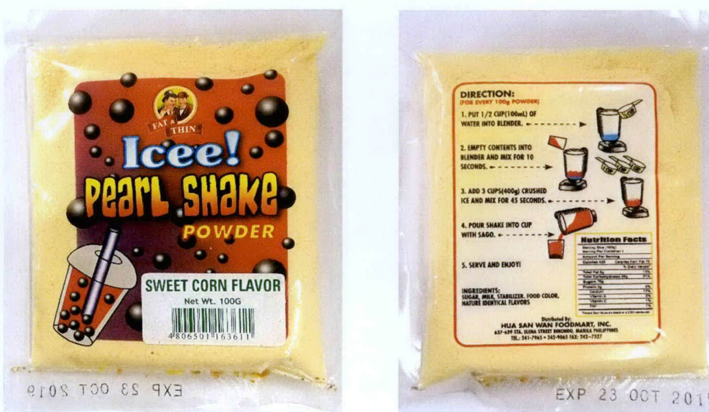
Figure 3. Unregistered FAT & THIN Icee! Pearl Shake Powder Sweet Corn Flavor