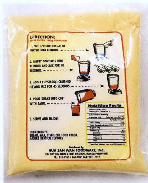
Figure 5. Unregistered FAT & THIN Icee! Pearl Shake Powder Melon Flavor

The FDA verified through post-marketing surveillance that the abovementioned food products are not authorized and the Certificates of Product Registration (CPR) have not been issued. Pursuant to the Republic Act No. 9711, otherwise known as the "Food and Drug Administration Act of 2009", the manufacture, importation, exportation, sale, offering for sale, distribution, transfer, non-consumer use, promotion, advertising or sponsorship of health products without the proper authorization is prohibited.