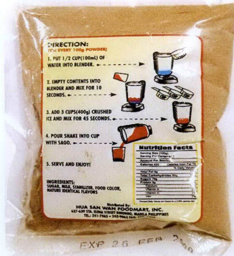
Figure 4. Unregistered FAT & THIN Icee! Pearl Shake Powder Choco Fudge Flavor