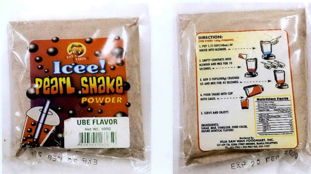
Figure 2. Unregistered FAT & THIN Icee! Pearl Shake Powder Ube Flavor