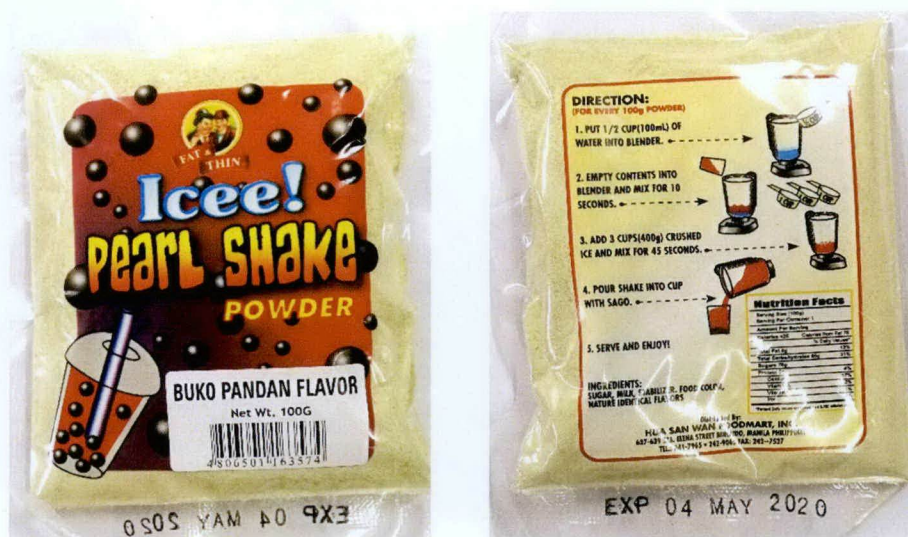
Figure 1. Unregistered FAT & THIN Icee! Pearl Shake Powder Buko Pandan Flavor

The Food and Drug Administration (FDA) advises the public from purchasing and consumption of the following unregistered food products: