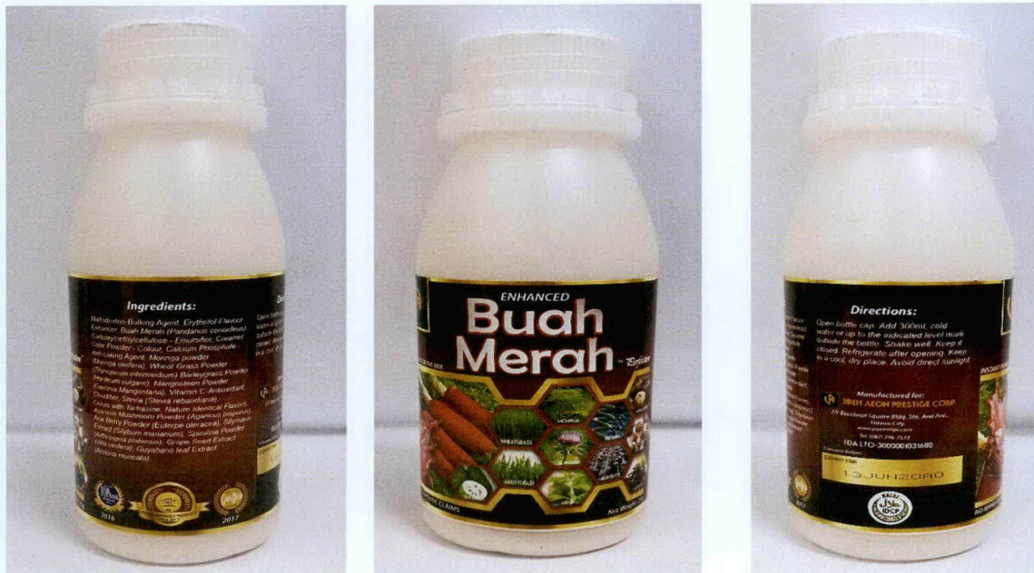
Figure 1. Unregistered PERFECTION™ ENHANCED Buah Merah Instant Powdered Drink Mix

The Food and Drug Administration (FDA) advises the public from purchasing and consumption of the following unregistered food products: