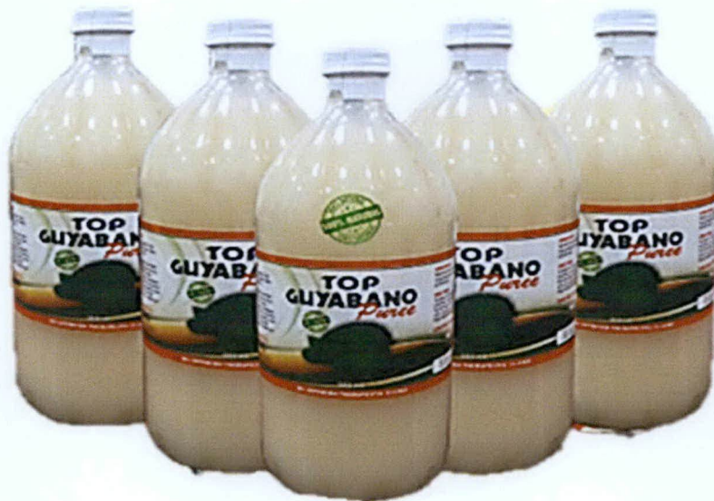
Figure 5. Unregistered TOP Guyabano Puree

The FDA verified through post-marketing surveillance that the abovementioned food products are not authorized and the Certificates of Product Registration (CPR) have not been issued. Pursuant to the Republic Act No. 9711, otherwise known as the “Food and Drug Administration Act of 2009”, the manufacture, importation, exportation, sale, offering for sale, distribution, transfer, non-consumer use, promotion, advertising or sponsorship of health products without the proper authorization is prohibited.