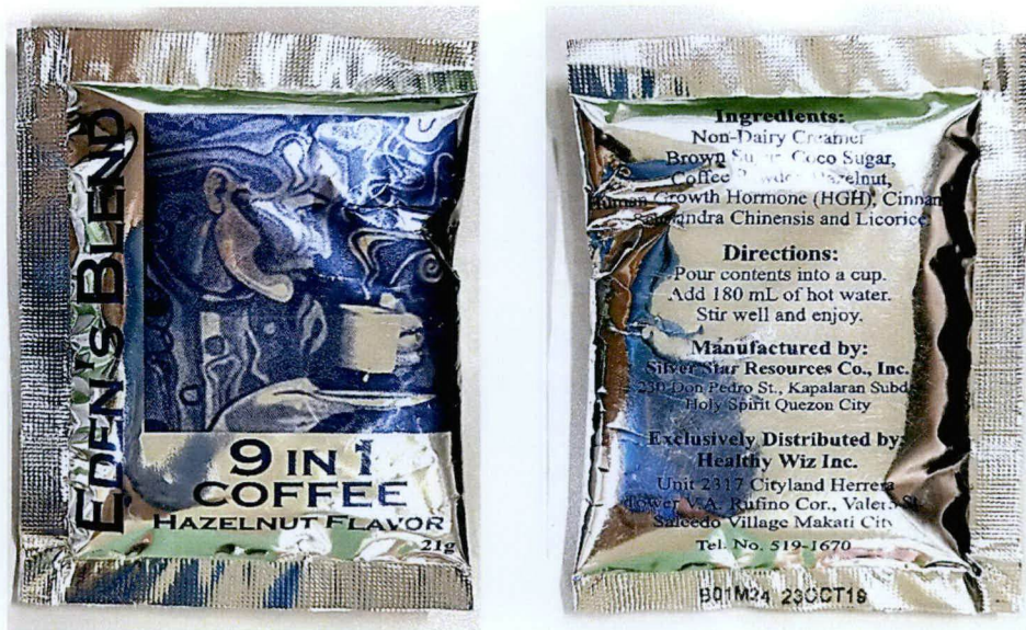
Figure 2. Unregistered EDEN'S BLEND 9-in-1 Coffee Hazelnut Flavor, 21g sachet