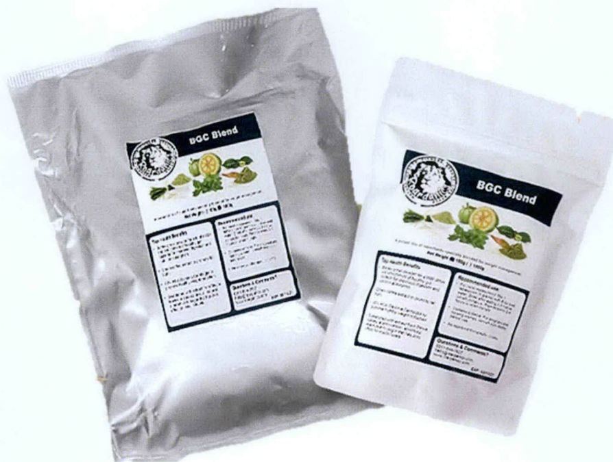
Figure 3. Unregistered ROORGANICS BGC Blend