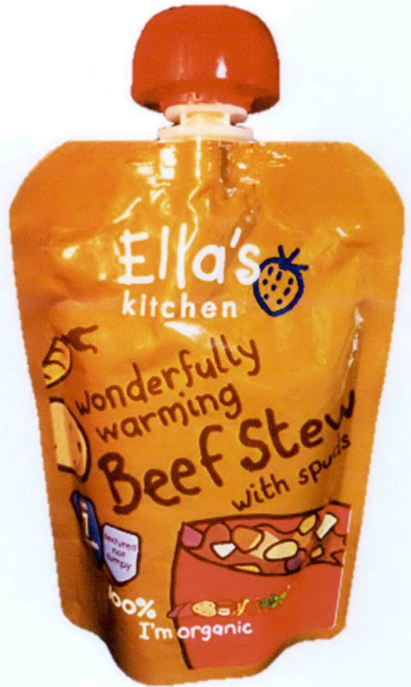
Figure 3. ELLA'S KITCHEN Wonderfully, Warming Beef Stew with Spuds