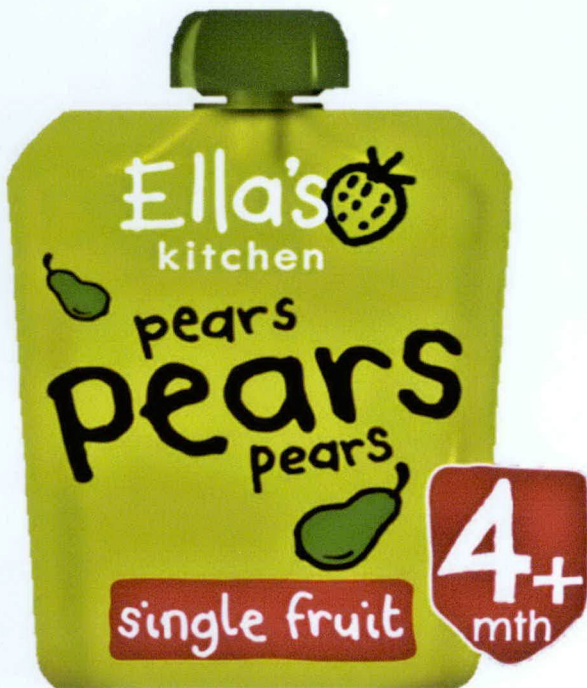
Figure 4. Unregistered ELLA'S KITCHEN Pears, Pears, Pears