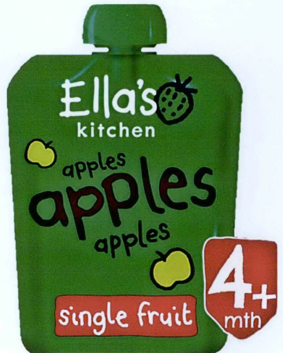
Figure 5. Unregistered ELLA'S KITCHEN Apples, Apples, Apples