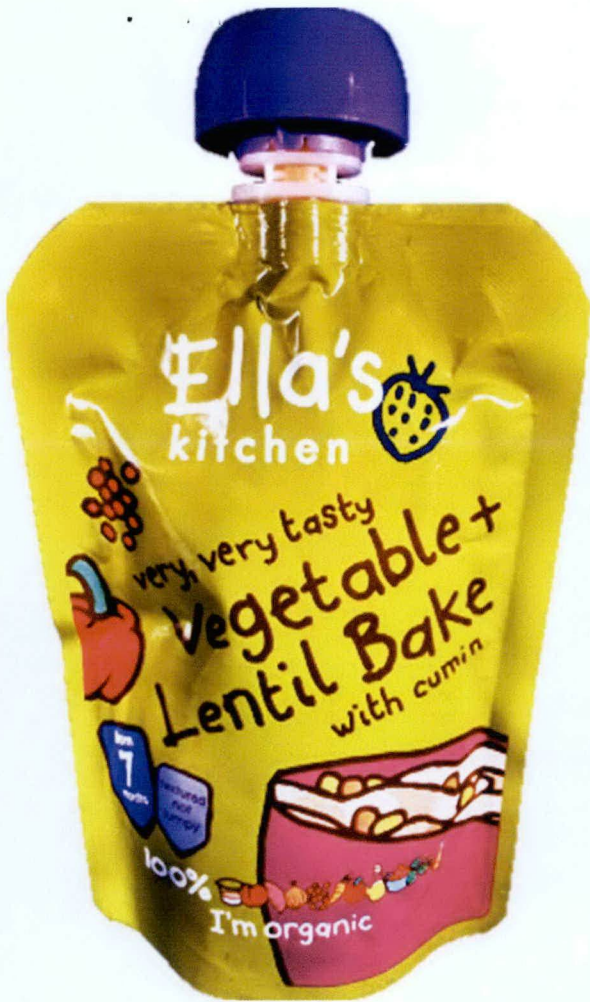
Figure 2. Unregistered ELLA'S KITCHEN Very, Very Tasty Vegetable + Lentil Bake with Cumin