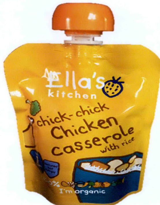
Figure 1. Unregistered ELLA'S KITCHEN Chick-Chick Chicken Casserole with Rice

The Food and Drug Administration (FDA) warns the public from purchasing and consuming the following unregistered food products: